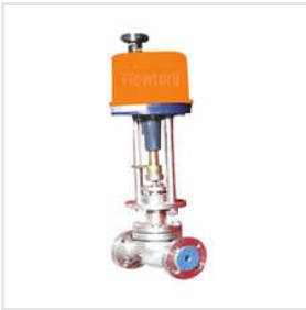
Linear Electric Actuator