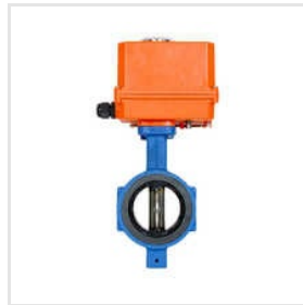
Industrial Motorized Butterfly Valve