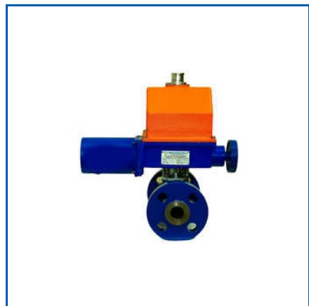
40 NB 2 WAY MOTORIZED BALL VALVE