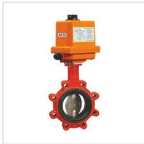
Motorised Butterfly Valve