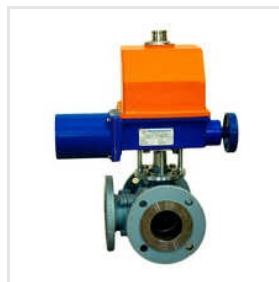
80 NB 3 Way Motorized Ball Valve