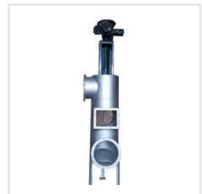
Industrial Poppet Damper