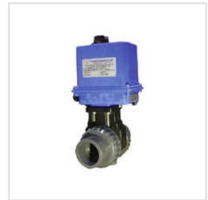
Gsm Oprated Actuator