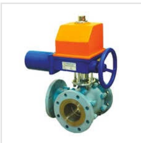
Motorized Ball Valve