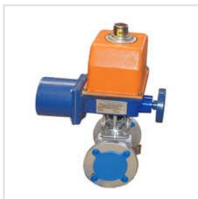
Motorized Ball Valve