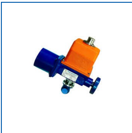
2 WAY MOTORIZED BALL VALVE

100 NB 3 Way Motorized Ball Valve, 2 Way Motorized Ball Valve, 40 NB 2 Way Motorized Ball Valve, 80 NB 3 Way Motorized Ball Valve, Electrical Actuator, Gsm Operated Actuator, Industrial Motorised Valve, Industrial Motorized Butterfly Valve, Industrial Poppet Damper, Linear Electric Actuator, Motorised Ball Valve With Starter, Motorised Butterfly Valve, Motorised Knife Edge Gate Valve, Motorized Ball Valve, Motorized Control Valve, etc.