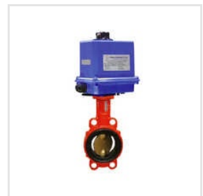
Gsm Oprated Actuator