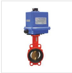
Industrial Motorised Valve