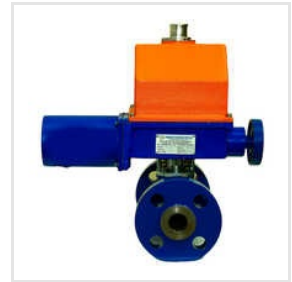
40 NB 2 Way Motorized Ball Valve