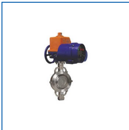
MOTORISED BALL VALVE WITH STARTER