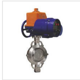
Motorised Ball Valve With Starter