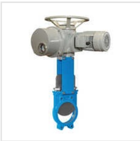
Motorised Knife Edge Gate Valve