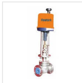
Motorized Control Valve