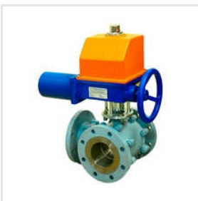
100 NB 3 Way Motorized Ball Valve