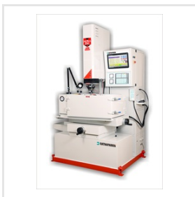
Altra ZNC ORB