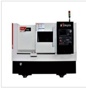
CNC Turning Machine