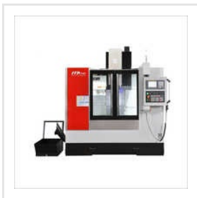
Maple MA-Series Vertical Machining