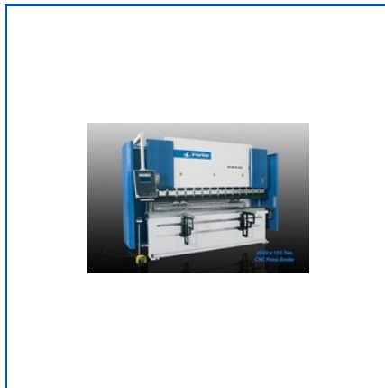
CNC PRESS BRAKE