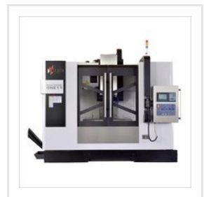
Maple M-ONE Series Vertical Machining