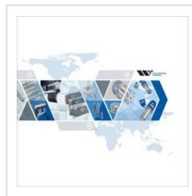
Turret Punch Tooling