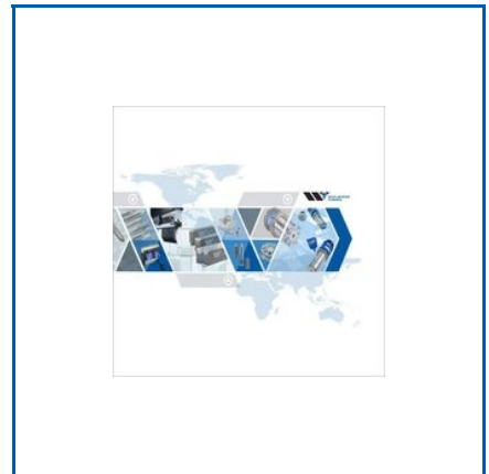
TURRET PUNCH TOOLING