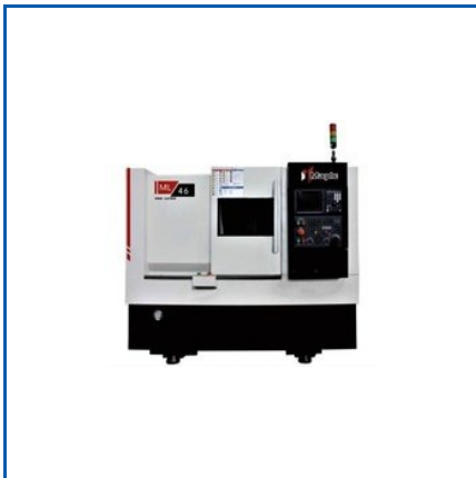
CNC TURNING MACHINE

Altra ZNC ORB, CNC Press Brake, CNC Turning Machine, Ear Loop Welding Machine, Face Mask Blanking Machine, Maple Double Column Machining Center, Maple M-ONE Series Vertical Machining Center, Maple MA-series Vertical Machining Center, Maple ME Series VMC Machine, Surface Grinder, Turret Punch Tooling, etc.