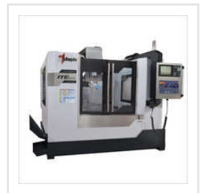
Maple ME Series VMC Machine