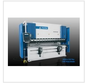
CNC Press Brake