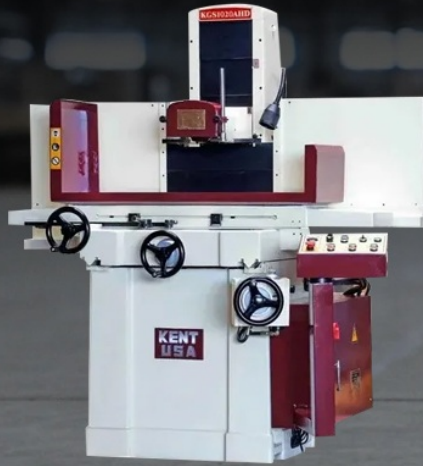
Surface Girnder and MA Sereis Machining Center

Perfection is well-represented in the quality of our products