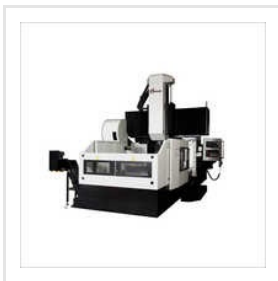
Maple Double Column Machining Center