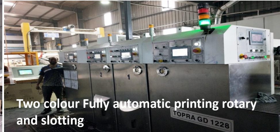
Two colour Fully automatic printing rotary and slotting