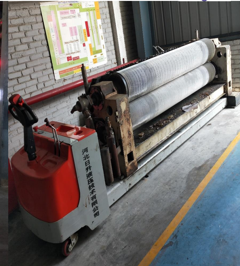
Five Ply IMPORTED HIGH SPEED state-of-the-art Automatic Board Plant Deckle 2500MM