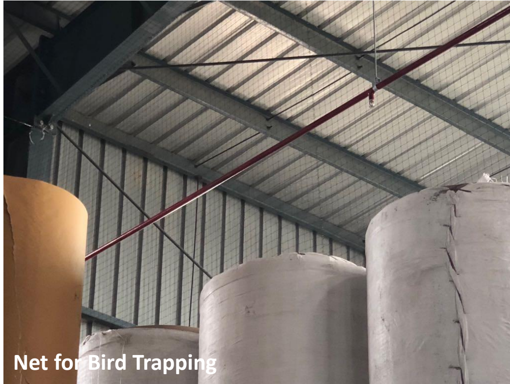
Net for Bird Trapping