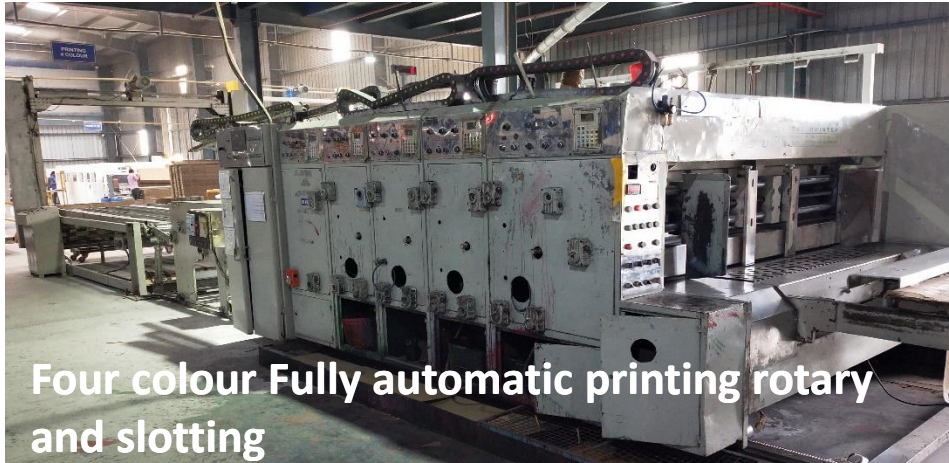
Four colour Fully automatic printing rotary and slotting