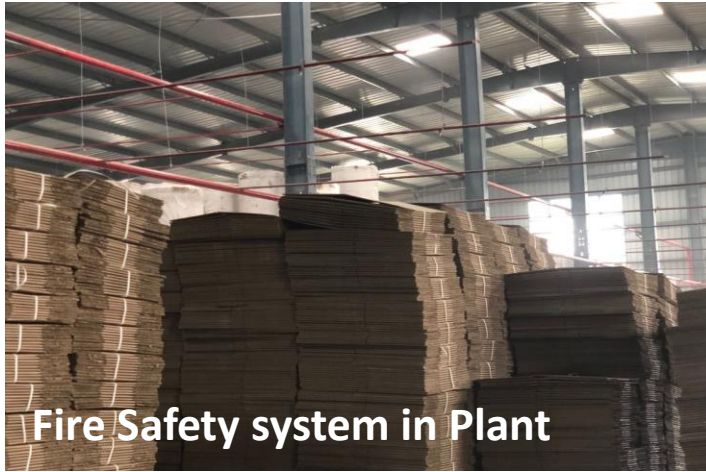
Fire Safety system in Plant