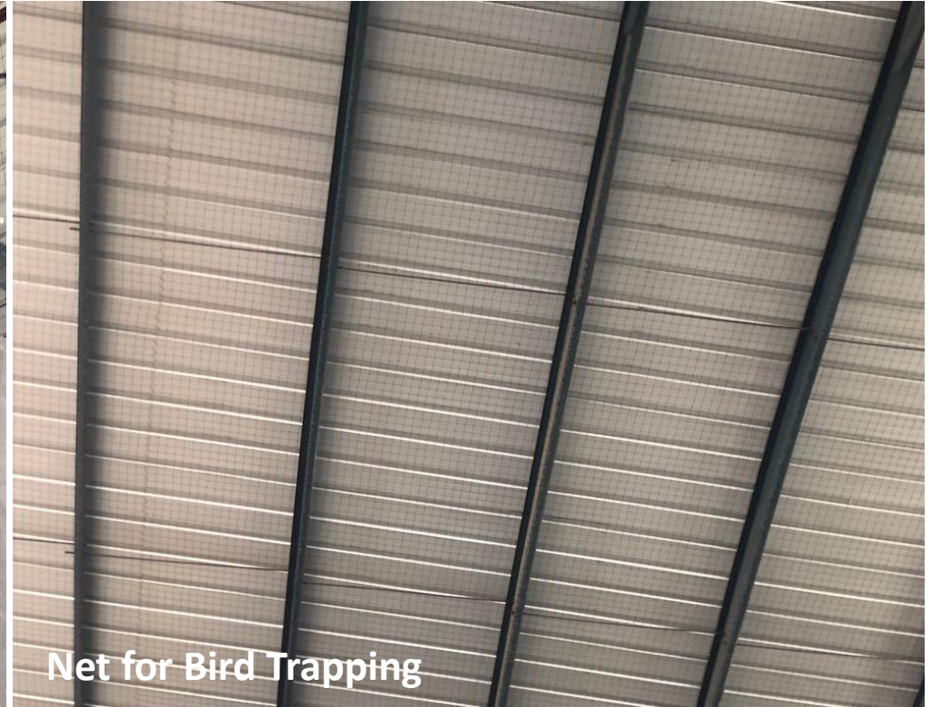
Net for Bird Trapping