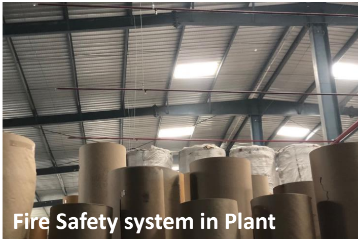
Fire Safety system in Plant