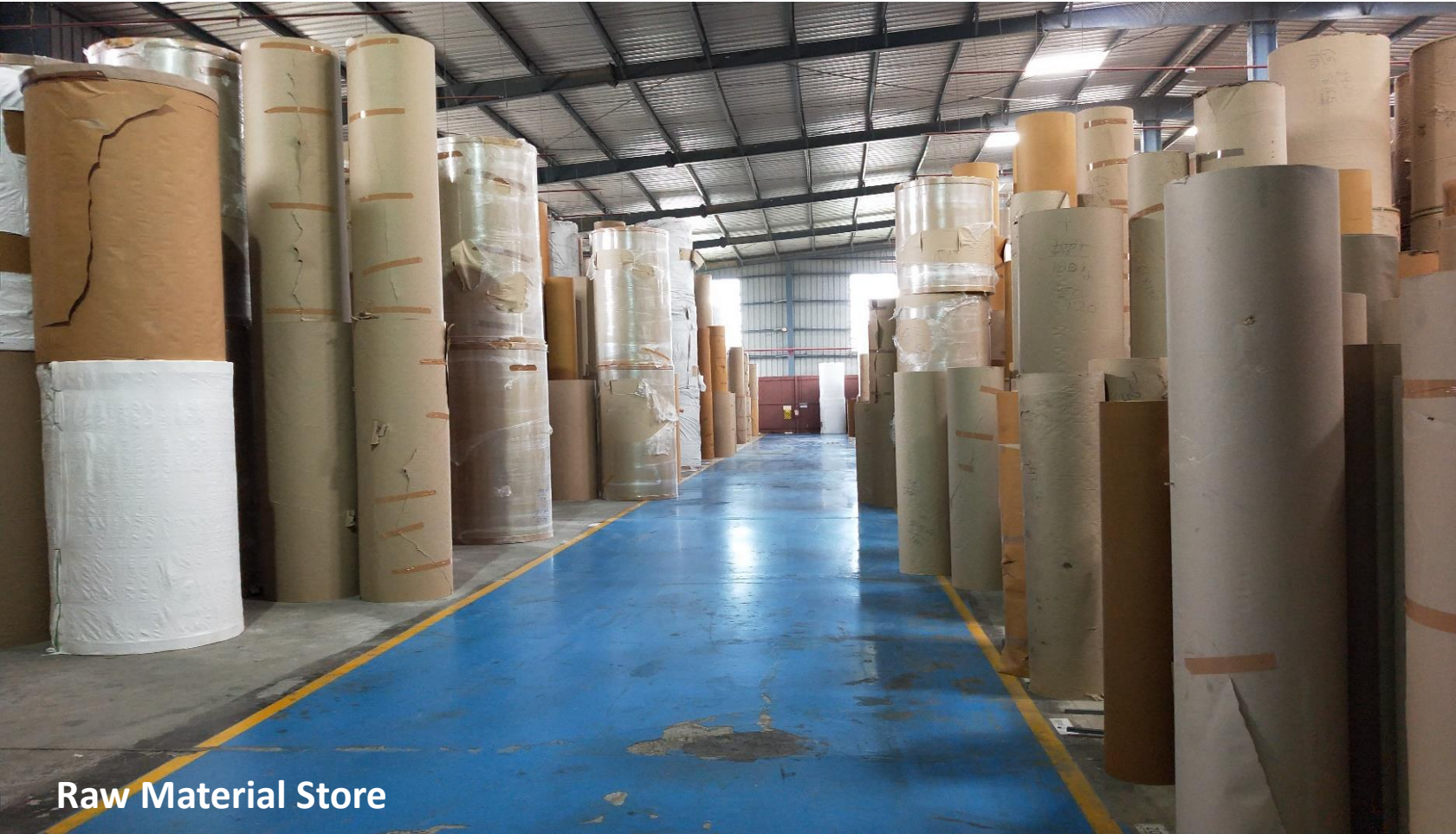
Raw Material Store