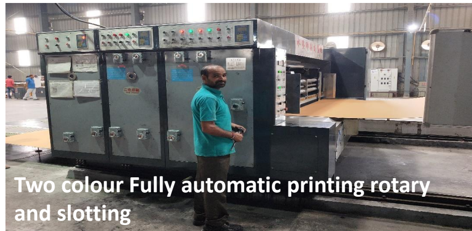
Two colour Fully automatic printing rotary and slotting