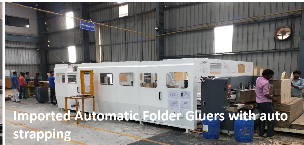
Imported Automatic Folder Gluers with auto strapping