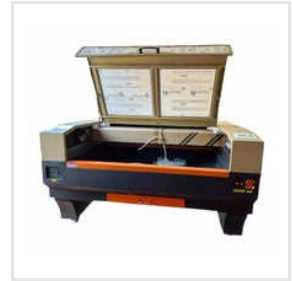
9060 Laser Cutting Machine