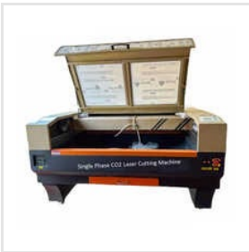
Single Phase CO2 Laser Cutting Machine