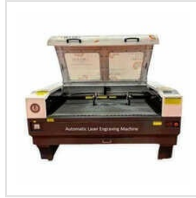
1610 Laser Engraving Machine