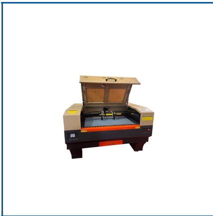
DOUBLE HEAD CO2 LASER CUTTING MACHINE 900-600

100W Co2 Laser Tube, 130W Co2 Laser Tube, 1325 Dual Head Co2 Laser Cutting Machine, 1325 Laser Cutting Machine, 1390 Co2 Laser Cutting Machine, 1390 Double Head Laser Cutting Machine, 1390 Laser Cutting Machine, 1390 Laser Cutting Machines, 1410 Co2 Laser Cutting Machine, etc.