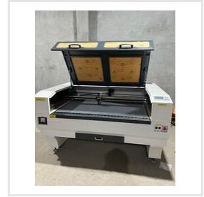
9060 Laser Cutting Machine