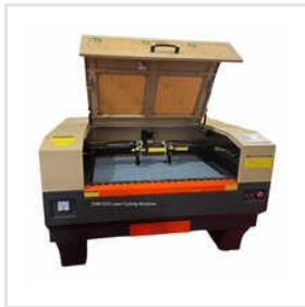
1390 Co2 Laser Cutting Machine