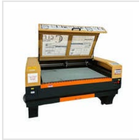
Non Metal Laser Cutting Machine