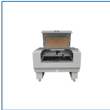
6040 DUAL HEAD LASER CUTTING MACHINE