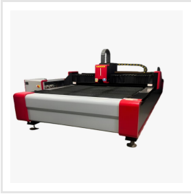
Fiber Laser Cutting Machine