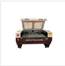
1410 Co2 Laser Cutting Machine