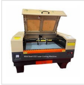
1610 Co2 Laser Cutting Machine