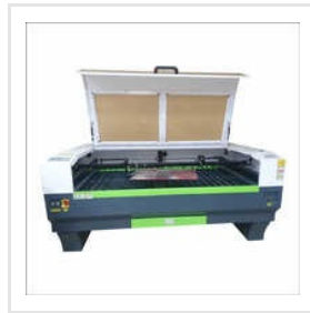
Mdf Laser Cutting Machine