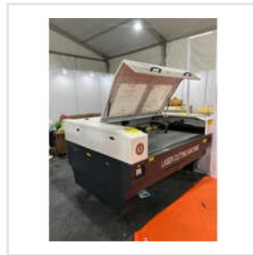
1390 Laser Cutting Machines