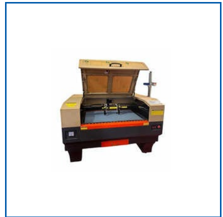
CO2 LASER CUTTING MACHINE