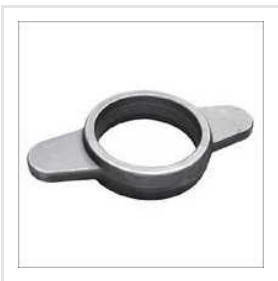
Automotive Part Forgings