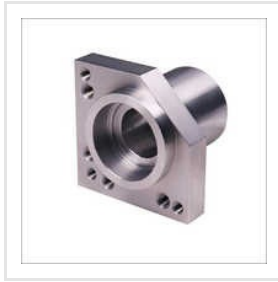
Closed Die Forgings