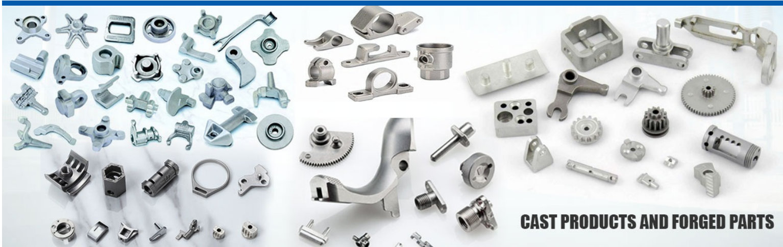
CAST PRODUCTS AND FORGED PARTS

Aluminium Investment Castings, Aluminum Die Casting, Automobile Part Casting, Automotive Metal Component Forgings, Automotive Part Forgings, CNC Machined Components, CNC Machining Services, CNC Precision Components Job Work, CNC Turn Mill Precision Machine Component, CNC Turning Machining Service, Closed Die Forgings, Drill Machine Job Work, Forged Automotive Components, Forged Ring, Forging parts, etc.