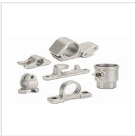
SS316 Investment Casting