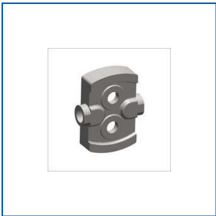
INDUSTRIAL METAL INVESTMENT CASTING

Aluminium Investment Castings, Aluminum Die Casting, Automobile Part Casting, Automotive Metal Component Forgings, Automotive Part Forgings, CNC Machined Components, CNC Machining Services, CNC Precision Components Job Work, CNC Turn Mill Precision Machine Component, CNC Turning Machining Service, Closed Die Forgings, Drill Machine Job Work, Forged Automotive Components, Forged Ring, Forging parts, etc.