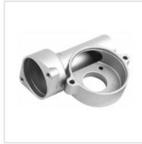
Aluminium Investment Castings