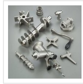
Stainless Steel Investment Casting