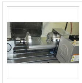
Vmc Milling Machining Service