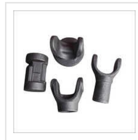
Automotive Metal Component Forgings