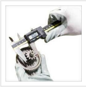
Precision Components Job Work