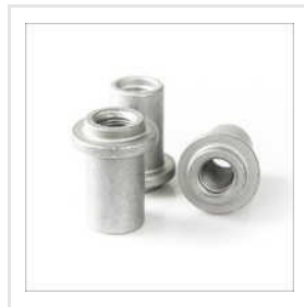
Lost Wax Investment Casting