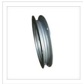
CNC Precision Components Job Work