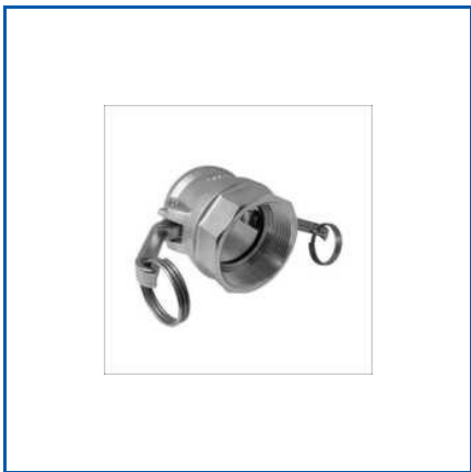
LOST WAX INVESTMENT CASTING