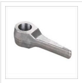
Forged Automotive Components