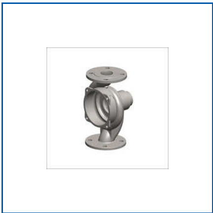
INDUSTRIAL PUMP INVESTMENT CASTING