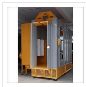
Powder Coating Booth