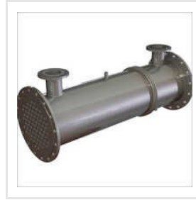
Shell And Tube Heat Exchanger