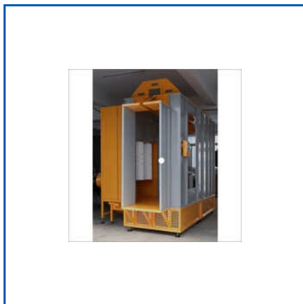
POWDER COATING BOOTH