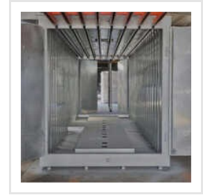
Industrial Powder Coating Oven