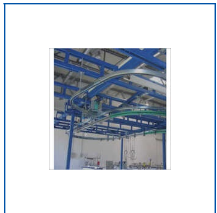
OVER HEAD TRACK CONVEYOR