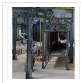
Over Head L Beam Conveyor