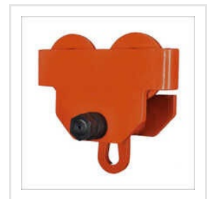
L Beam Trolley