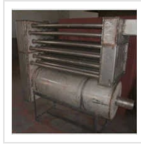
Drum Heat Exchanger