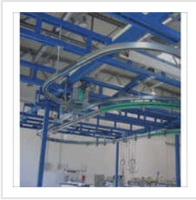
Over Head Track Conveyor