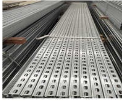
SS Strut Channel