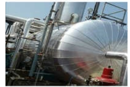
Cold And Hot Installation Service