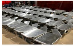
Customized Sheet Metal Fabrication