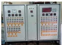
Industrial Supplier Electric Installation