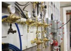
Industrial Manifold Systems Service