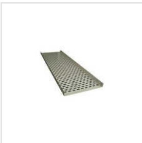
GI-Powder Coated Cable Tray