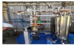
Industrial Equipment Installation Service