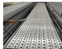
SS STRUT CHANNEL