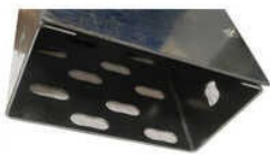
STEEL CABLE TRAY

All Type Pipe Installation Service, Cold And Hot Installation Service, Copper Flexible Jumper, Customized Sheet Metal Fabrication, GI-MS Pipe Nipple, GI-Powder Coated Cable Tray, Industrial Customized Sheet Metal Fabrication, Industrial Equipment Installation Service, Industrial Manifold Systems Service, Industrial Supplier Electric Installation Service, Industrial Ventilation Duct Installation Service, SS Strut Channel, Spring Nut, Steel Cable Tray, etc.