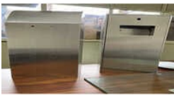
Industrial Customized Sheet Metal