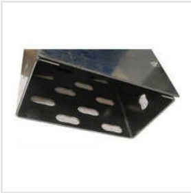
Steel Cable Tray