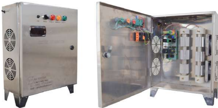
Industrial Ozone Generators