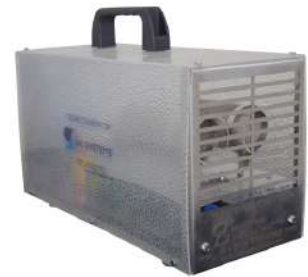
Air Ozone Purifiers