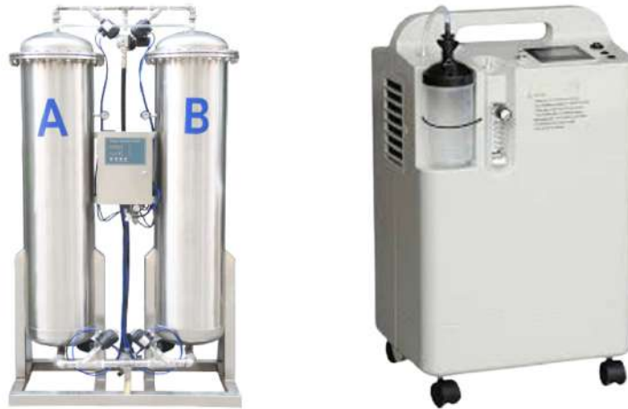
Industrial Oxygen Generators