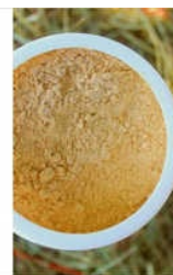
Brewers Yeast Powder