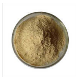
Casein Acid Hydrolysate