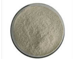
Meat Extract Powder