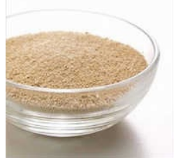
Active Dry Yeast