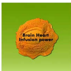
Brain Heart Infusion Powder