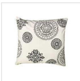
Poly Velvet H And Table Print Cushion