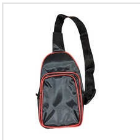
12x9 Inch Matty Crossbody Bags