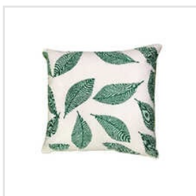
Poly Velvet H And Table Print Cushion