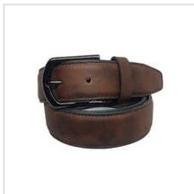
Mens Leather Belt