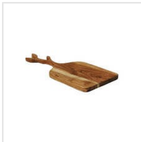
20x8x.75 Inch Wooden Chopping Board