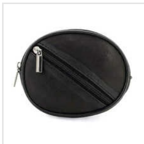
9x9 CM Sheep Leather Coin Pouch