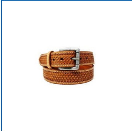
MENS FANCY BUFF BELT

10x10x5 Inch Wooden Bowl, 10x6 Mango Wood Wooden Mushroom, 10x7 CM Sheep Leather Coin Pouch, 11x7 CM Sheep Leather Coin Pouch, 11x8 CM Sheep Leather Coin Pouch, 12x8 CM Sheep Leather Coin Pouch, 12x9 Inch Fabric Crossbody Bags, 12x9 Inch Hunter Leather Sling ABG Bag, etc.