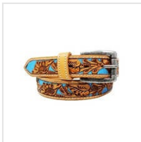
Mens Multicolor Buff Belt