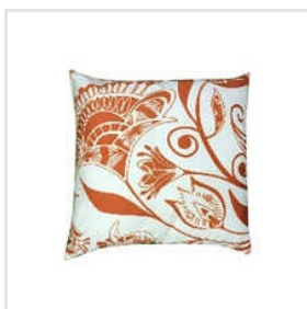
Poly Velvet H And Digital Print Cushion