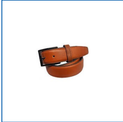
MENS LIGHT BROWN BUFF BELT