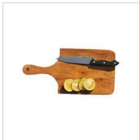
17x8x.75 Inch Wooden Chopping Board