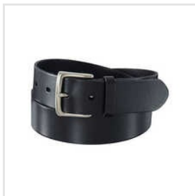
Mens Black Buff Belt