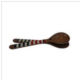
Salad Server Set Of 2