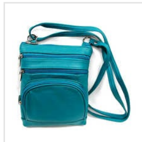
20x24 CM NDM Leather Sling Bag