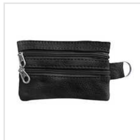
10x7 CM Sheep Leather Coin Pouch