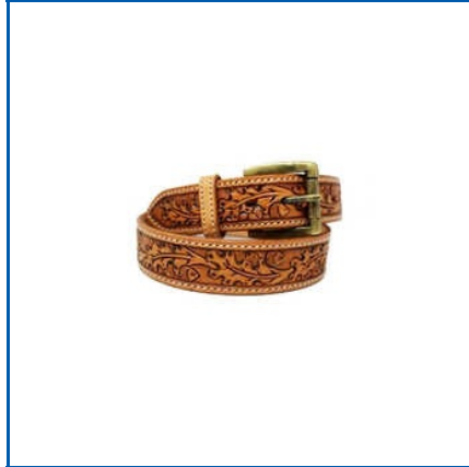
MENS CARD HOLDER BELT