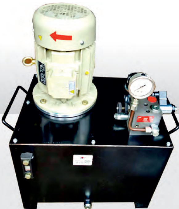
HYDRAULIC POWER PACK FOR GOODS LIFT