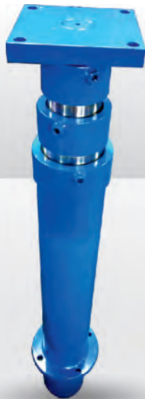
TELESCOPE HYDRAULIC CYLINDER