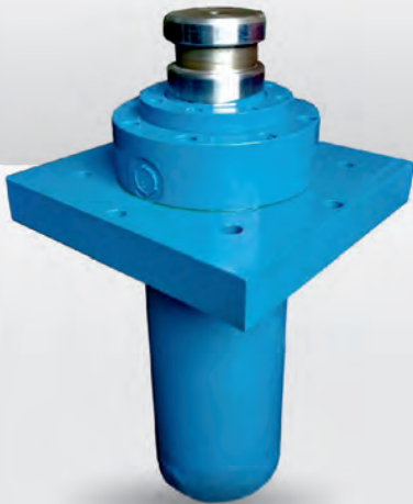
PRESS HYDRAULIC CYLINDER