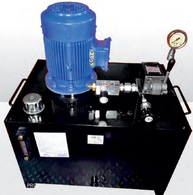
HAND LEVER OPERATED HYDRAULIC POWER PACK