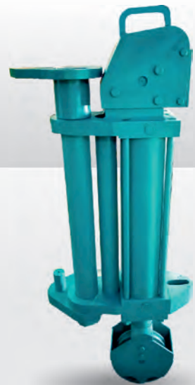
SPECIAL PURPOSE HYDRAULIC CYLINDER