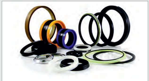
Hydraulic Cylinder Seal Kit