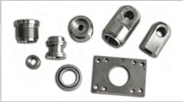
Hydraulic Cylinder Spares