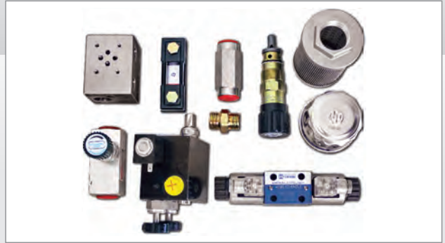
Hydraulic Power Pack Spares