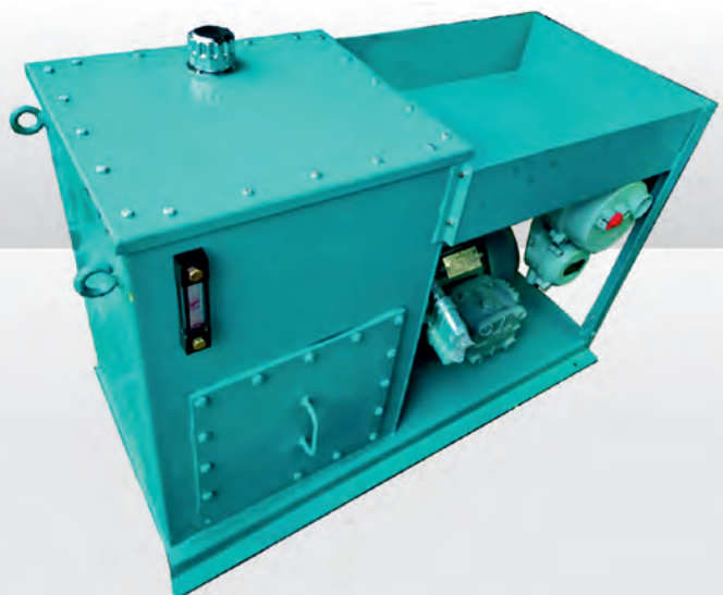
SPECIAL PURPOSE HYDRAULIC POWER PACK