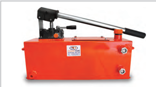
Hydraulic Hand Pump