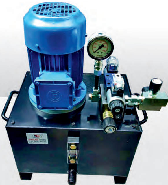
SOLENOID OPERATED HYDRAULIC POWER PACK