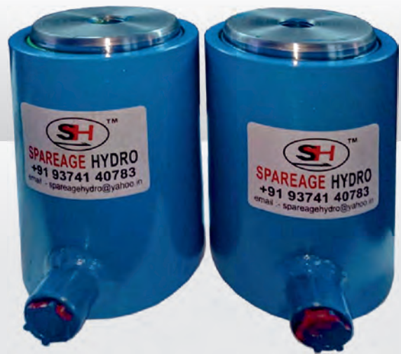
RAME TYPE HYDRAULIC CYLINDER