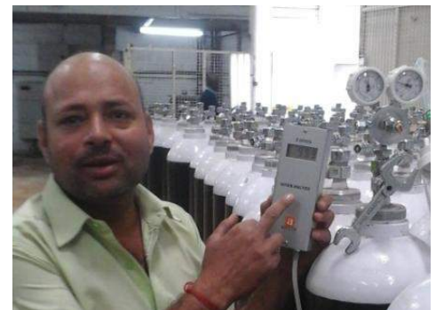
HIGH OXYGEN PURITY INDUSTRIAL OXYGEN FROM 99.7% TO 99.9%