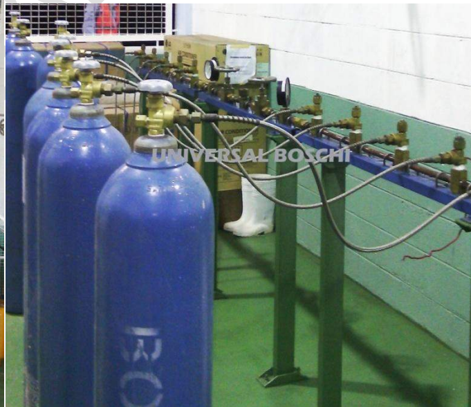
Cylinder Filling System