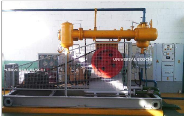
Air Compressor OILFREE (ROTARY OPTIONAL)