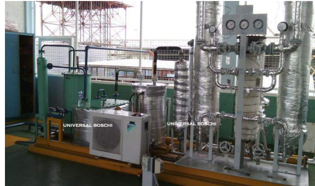
Purification Unit on Skid