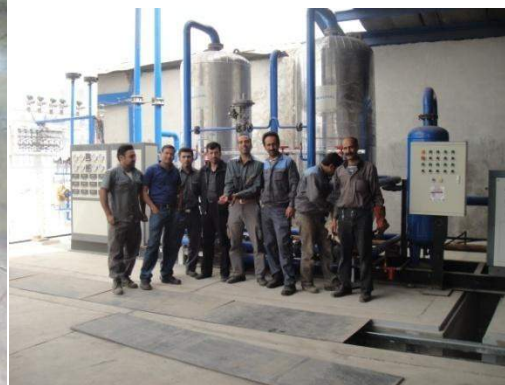
FULL VIEW OF PLANT UBT-300