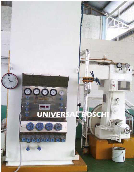
Air separation column with cold box