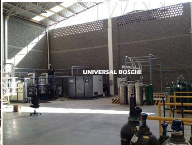
AIR SEPARATION COLUMN, PURIFICATION UNIT SKID WITH ROTARY ATLAS COPCO AIR COMPRESSOR