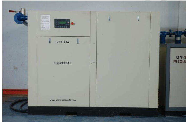
COLD BOX WITH ROTARY AIR COMPRESSOR- SINGLE PUSH BUTTON START