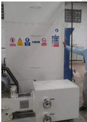
LIQUID OXYGEN PUMP FOR CYLINDER FILLING