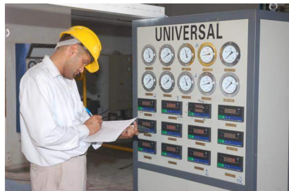
EASY CONTROL VALVES MOUNTED ON THE COLUMN –COLD BOX. Control instrument panel – all pressure flow and temperature readings displayed on one panel.