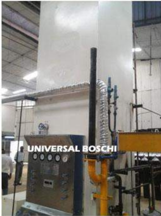
AIR SEPARATION COLUMNN