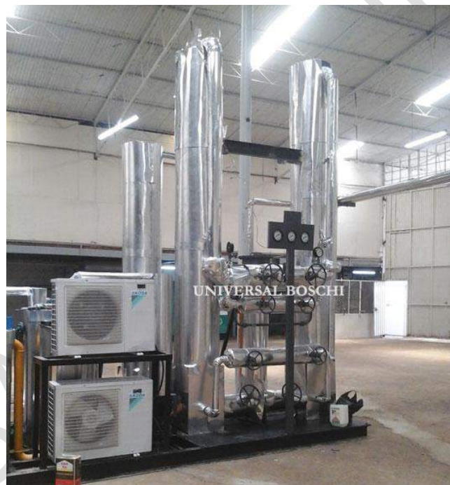
SKID MOUNTED PROCESS SKID