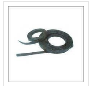
Dual Wall Heat Shrinkable Tube