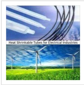
Electrical Heat Shrinkable Tubes