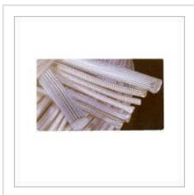
Fiberglass Slewing Tube