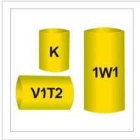
Heat Shrinkable Markers