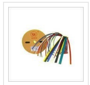
Flame Retardant Heat Shrinkable Tube