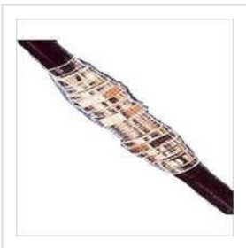
PTFE Heat Shrink