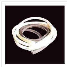
HTG Fiberglass Slewing