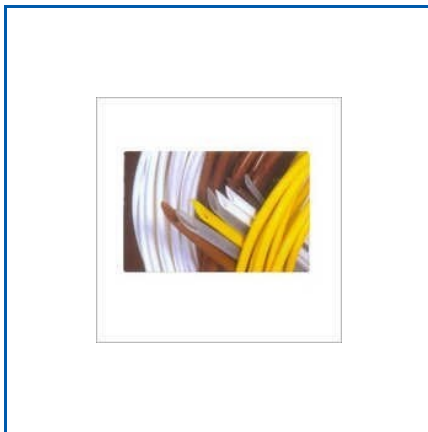
PURE SILICONE RUBBER TUBE