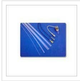
Chemical Resistant PVDF Tubing