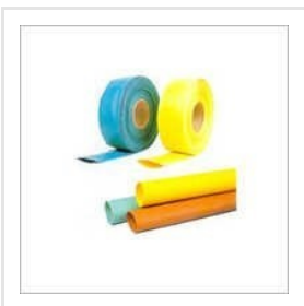
Bus Bar Insulating Tube