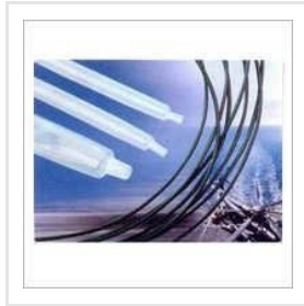
Thin Wall Flexible PVDF Tubing