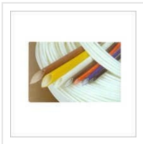
Fiberglass Insulation Slewing