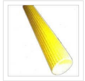
Acrylic Fiberglass Slewing