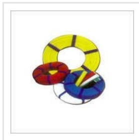
Acrylic Fiberglass Insulation Slewing