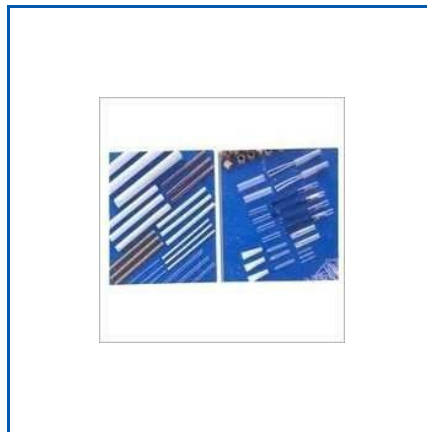
MYLAR HEAT SHRINKABLE TUBE