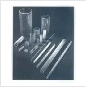
Acrylic Polyester Tube