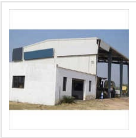
Industrial Warehouse Shed