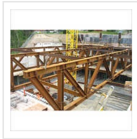
Heavy Steel Fabrication Service