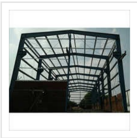
Pre Fabricated Building Structure