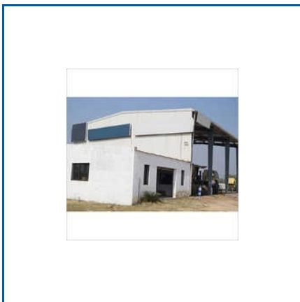
INDUSTRIAL WAREHOUSE SHED

Airport Hangar Shed, Fabricated Structure, Factory Shed, Godown Shed, Heavy Steel Fabrication Service, Heavy Structural Fabrication Service, Industrial Shed, Industrial Warehouse Shed, Mezzanine Building, Pre Engineering Building Structure, Pre Fabricated Building Structure, Pre-Engineered Building, Prefabricated Building, Prefabricated Sheds, Prefabricated Structures, etc.