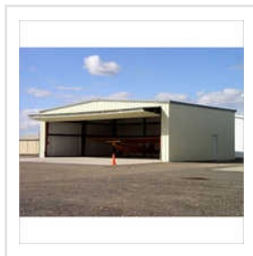
Airport Hangar Shed