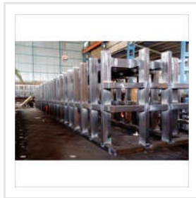
Heavy Structural Fabrication Service