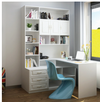
● Office Furniture