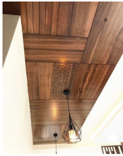
● False Ceiling