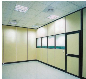
● Partition, Wall Paneling, Wall and Column Cladding