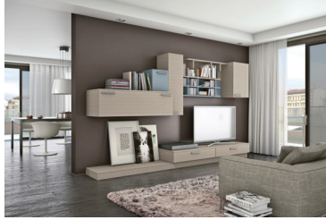
● All type of Modular Furniture