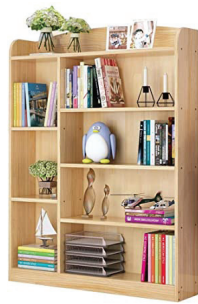
● Different types of Racks