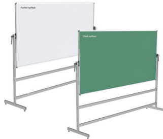
● Writing Boards