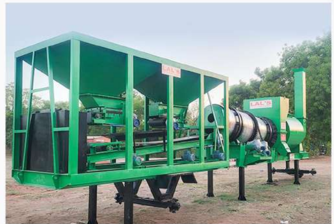
MOBILE (WHEELED PLANT)