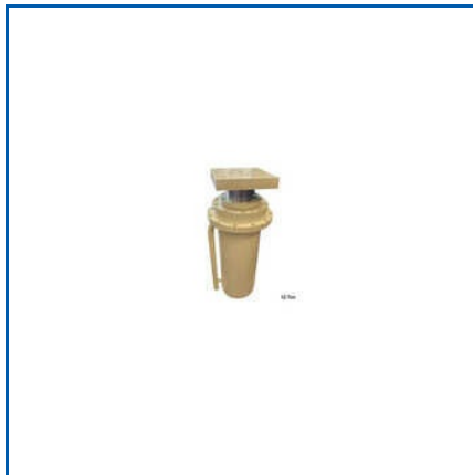
HYDRAULIC PRESS CYLINDER