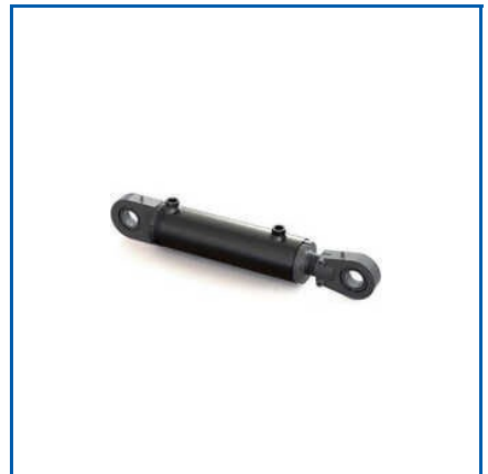
STAINLESS STEEL HYDRAULIC CYLINDER