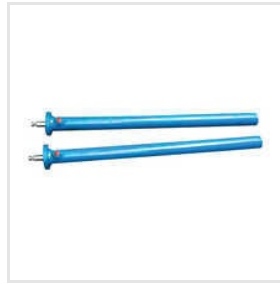
Passenger Lift Hydraulic Cylinder