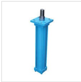
Hydraulic Flange Mounting Cylinder