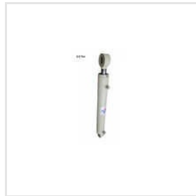
Mild Steel 5.5 Ton Industrial Hydraulic