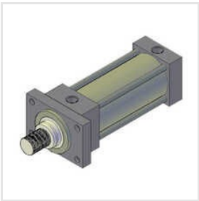
Front Flange Mounted Type Hydraulic