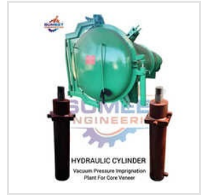
Double Acting Trunnion Mount