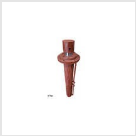
Hydraulic Bell Press Cylinder