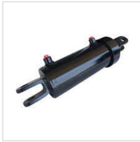
Telescopic Hydraulic Cylinder