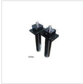
Front Flange Mounting Hydraulic Cylinders