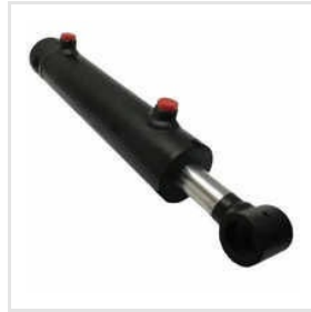
Double-Acting Hydraulic Cylinder