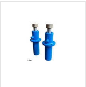
Blue Hydraulic Loader Cylinders