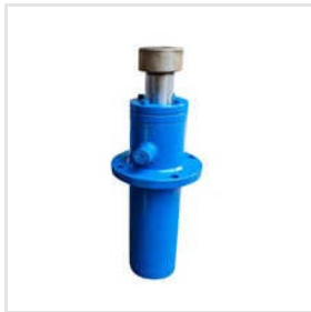
Mild Steel Blue Hydraulic Loader