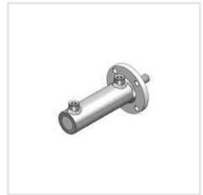
Rod Side Flange Mounting Hydraulic