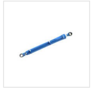
Hydraulic Steel Cylinder