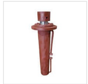
MS Hydraulic Bell Press Cylinder