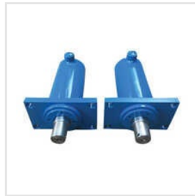
Press Hydraulic Cylinder