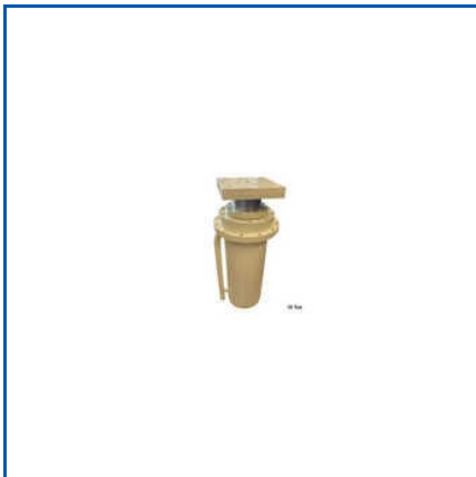
HYDRAULIC PRESS MACHINE CYLINDERS

Achieve Stainless Steel Rear Circular Flange Mounting Hydraulic Cylinders, All Type Hydraulic Cylinders, Automatic Hydraulic Deep Drawpress, Back Flanch Mountain Hydraulic Cylinder, Blue Hydraulic Loader Cylinders, Bolted Cylinder Hydraulic, Coconut Coir Fiber Baler, Cotton Waste Balers, Clevis Mounted Hydraulic Cylinders, Crane Hydraulic Cylinder, Etc.