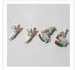
MCB Latch Assembly