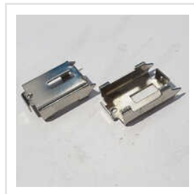
MCB MS Outer Clip