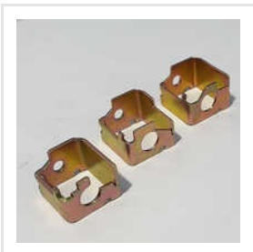
MCB Magnetic Yoke