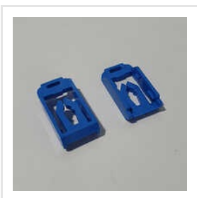
MCB Outer Clip