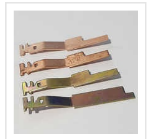
MCB MS Rail