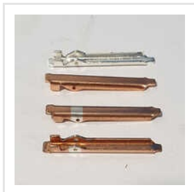
MCB Moving Contact