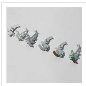
MCB Outer Latch