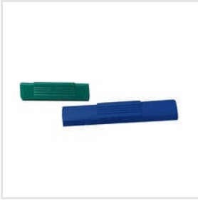
MCB Knob Sleeves