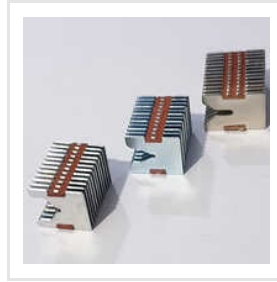
MCB ARC Chute Assembly