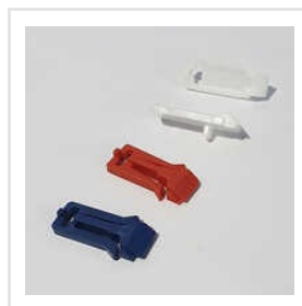
MCB Snap Pusher