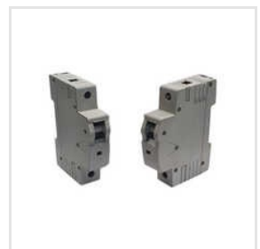
Plastic MCB Body