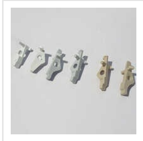
MCB Inner Latch