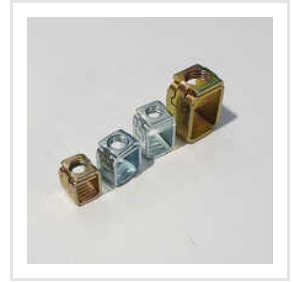
MCB Bushing Clamp