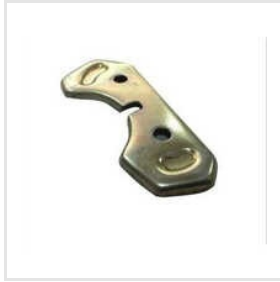
Precision Sheet Metal Components