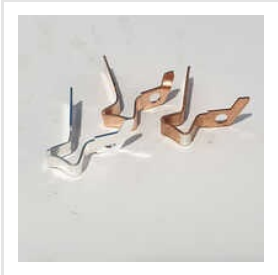
MCB Fixed Contact