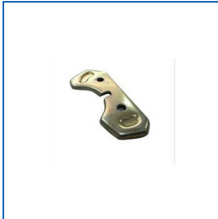
PRECISION SHEET METAL COMPONENTS