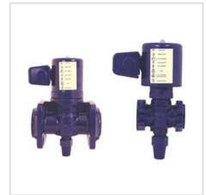
Ammonia Solenoid Valves