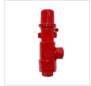
Safety Relief Valves