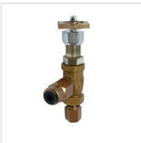
Angle Gauge Valves