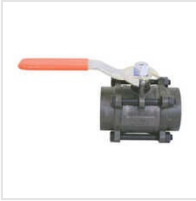
ABV- AMMONIA BALL VALVES Size-15 MM TO