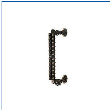
REFLEX GLASS LIQUID LEVEL INDICATOR