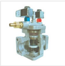
SOSV-SERVO OPERATED SOLENOID