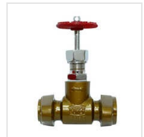
Hand Expansion Needle Regulating