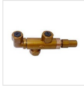
Three Way Dual Relief Valve Manifold