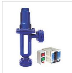
Electronic Liquid Level Controller