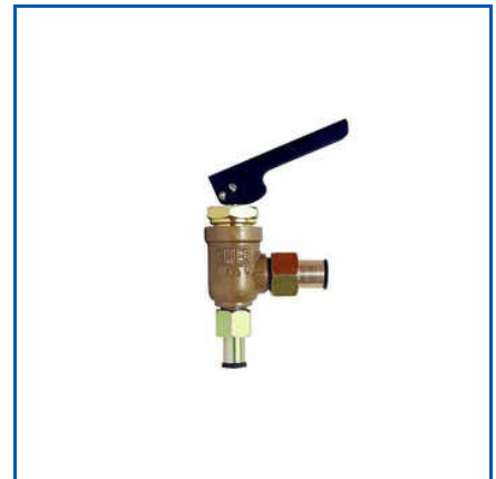
QUICK CLOSING OIL DRAIN VALVE