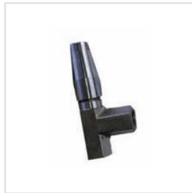
Pressure Gauge Valves