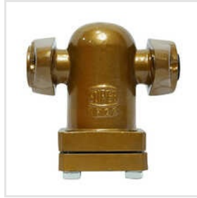
Y Strainer Valves