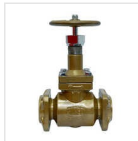
Shut Off Valves