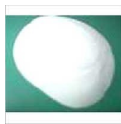
Zinc Sulphate Heptahydrate