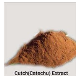
CUTCH (CATECHU) EXTRACT TANNIN