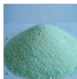
Ferrous Sulphate Heptahydrate