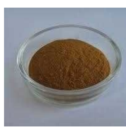
Leather Tanning Agent