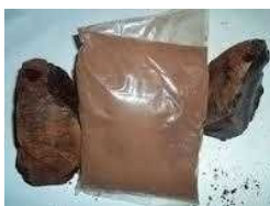
ACACIA CATECHU EXTRACT