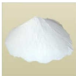
ZINC SULPHATE MONOHYDRATE

Acacia Catechu Extract, Acacia Tannin Chemicals, Calcium Iodate, Cobalt Carbonate, Cobalt Sulphate, Copper Sulphate, Cutch (Catechu) Extract Tannin, Dried Ferrous Sulphate, Ferrous Sulphate Heptahydrate, Ferrous Sulphate Monohydrate, Leather Chemicals, Leather Tanning Agent, Magnesium Sulphate Anhydrous, Magnesium Sulphate Monohydrate, Manganese Oxide, etc.