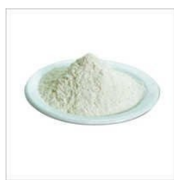
Dried Ferrous Sulphate