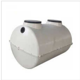
Human Waste FRP Bio Digester Sewage Septic