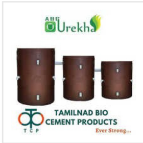
Concrete Industrial Waste Water