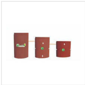
PE Black Bio Septic Tank