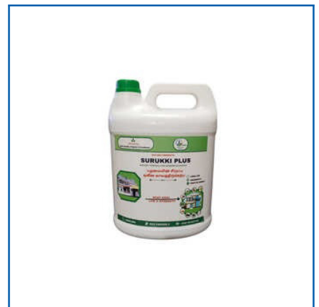
SURUKKI PLUS ANCIENT FORMULA