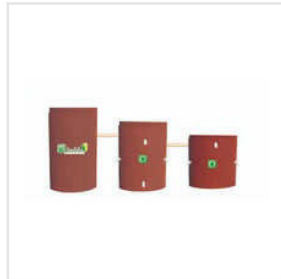
Readymade Bio Septic Tank