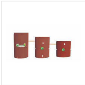
RCC 1000 Liter Non Filling Septic Tank