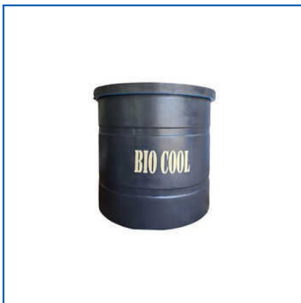
BIO COOL DRINKING WATER TANK

1000 Litre Sewage Septic Tank, 5 Ltr Poochu Plus Ancient Solution, Bio Cement Industrial Waste Water Treatment Tank, Bio Cement Septic Tank, Bio Cool Drinking Water Tank, Bio Septic Tank, Concrete Industrial Waste Water Treatment Plant Tank, FRP Bio Septic Tank, etc.