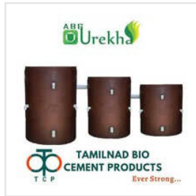
Bio Cement Industrial Waste Water