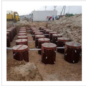
FRP Industrial Septic Tank