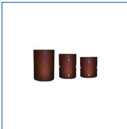
BIO SEPTIC TANK