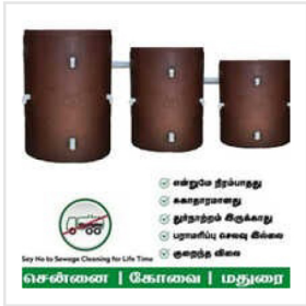
FRP Fiberglass Bio Digester Septic Tank