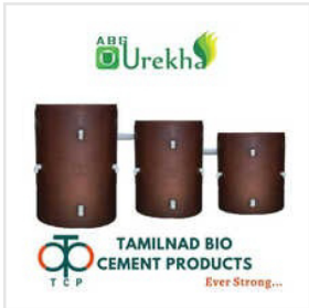
Rcc Bio Septic Tank