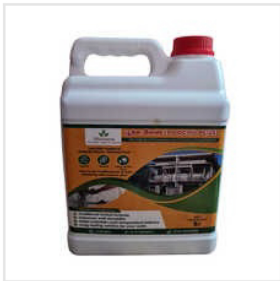
5 Ltr Pochu Plus Ancient Solution