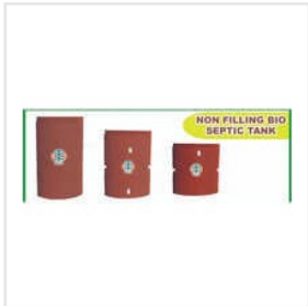
RED Non Filling Bio Concrete Septic Tank