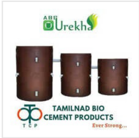
FRP Bio Septic Tank