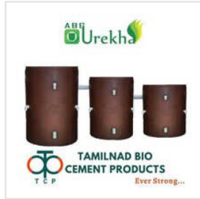
Round Concrete Septic Tank