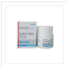
200mg Sorafenib Tablets