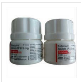
0.5mg Entecavir Tablets