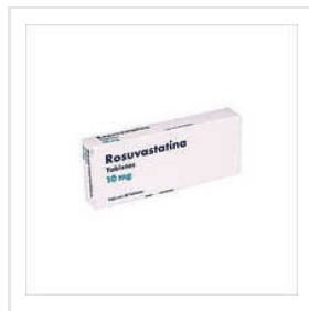
10 Mg Rosuvastatin Tablets