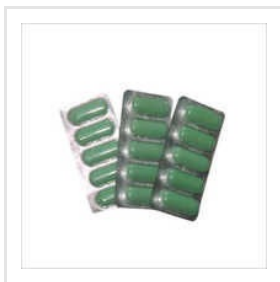
Generic Sumycin Tetracycline Tablet