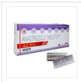
1mg Altraz Anastrozole Tablets IP