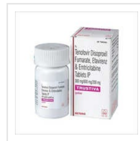
Tenofovir Disoproxil Fumarate Efavirenz