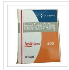
Levin 400mg Tablets IP