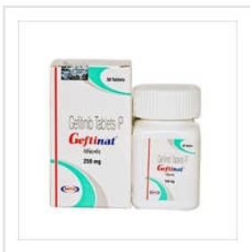
250mg Gefitinib Tablets IP