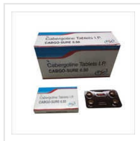
Cabergoline Tablets IP