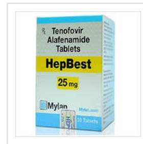
25mg Hepbest Tenofovir Alafenamide