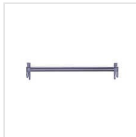
Kwikstage Scaffolding Ledger