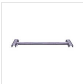
Transom Cuplock System