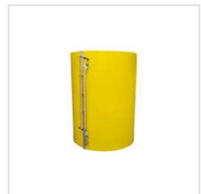
PE-500 Regular Section