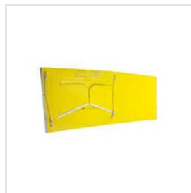
Flat Door Section