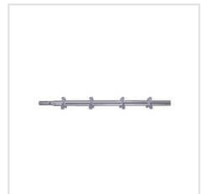
Vertical Kwikstage System