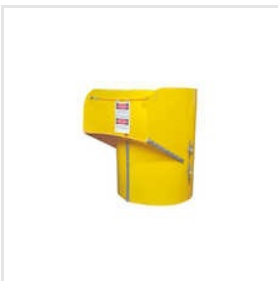
PE-500 Top Hopper Section