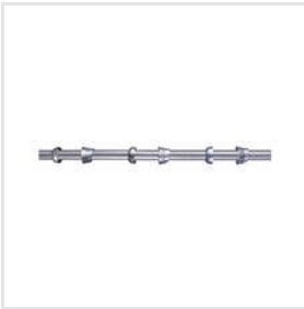
Vertical Cuplock System