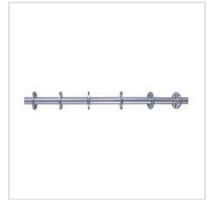
Scaffolding Vertical Ring Lock System