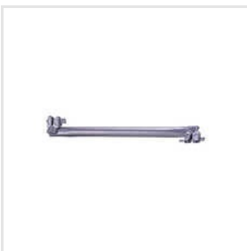
Scaffolding Ring Lock Brace