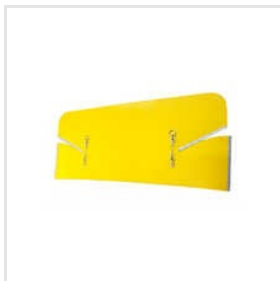
Flat Top Hopper Section