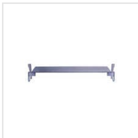
Kwikstage Scaffolding Transom