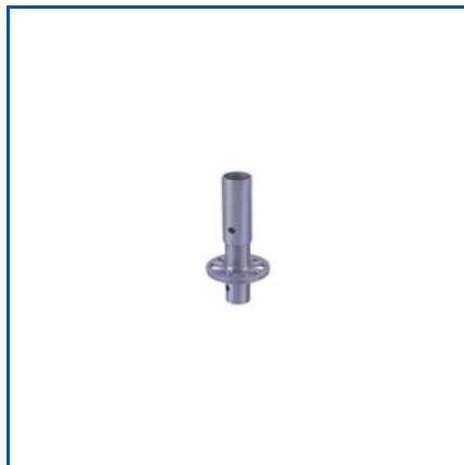
SCAFFOLDING BASE COLLER