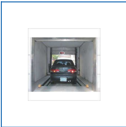
TRACTION CAR LIFT

Four Pole Hydraulic Stack Parking, Multi-Level Circulation Car Parking System With Pallet, Traction Car Lift, Two Pole Stack Parking Premium Medium Duty, Varam Five Level Puzzle Parking System, etc.