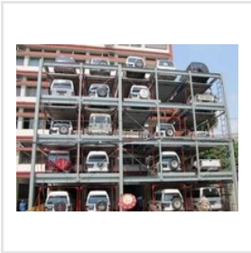
Varam Five Level Puzzle Parking System