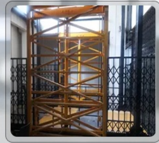
Hydraulic Rope Type Car Lift

Four Pole Hydraulic Stack Parking, Multi-Level Circulation Car Parking System With Pallet, Traction Car Lift, Two Pole Stack Parking Premium Medium Duty, Varam Five Level Puzzle Parking System, etc.