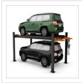
Four Pole Hydraulic Stack Parking