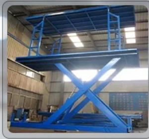
Scissors Type Car Lift