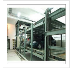
Multi-Level Circulation Car Parking System