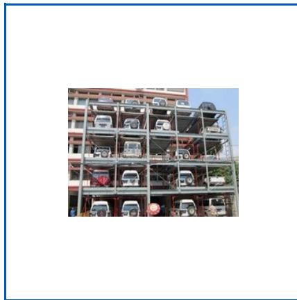
VARAM FIVE LEVEL PUZZLE PARKING SYSTEM