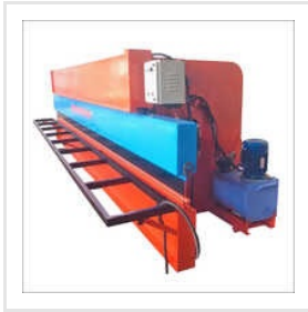
Electric Rolling Shutter Guid Machine