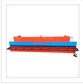
Industrial Rolling Shutter Guid Machine