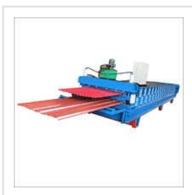
Electric Rolling Shutter Door Machine