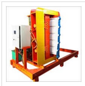
Vertical Hydraulic Crimping Machine