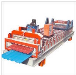
COLOUR ROOF SHEET ROLL FORMING MACHINE

Cold Roll Forming Machine, Colour Roof Sheet Roll Forming Machine, Double Deck Roof Roll Forming Machine, Electric De Coiler, Electric Hoist, Electric Mini Slitting Machine, Electric Rolling Shutter Door Machine, Electric Rolling Shutter Guid Machine, Electric Roof Accessories Bending Machine, Electric Sheet Cutting Sharing Machine, Hydraulic Crimping Machine, Industrial CZ Type Purling Machine, Industrial EOT And Gantry Crane, Industrial Mini Slitting Machine, Industrial Rolling Shutter Door Machine, etc.