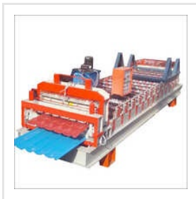
Industrial Tile Roll Forming Machine