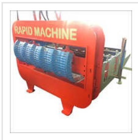
Industrial EOT And Gantry Crane