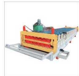
INDUSTRIAL ROOF SHEET ROLL FORMING MACHINE