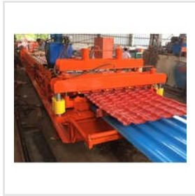
Sheet Roll Forming Machine