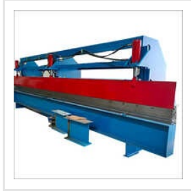
Electric Roof Accessories Bending