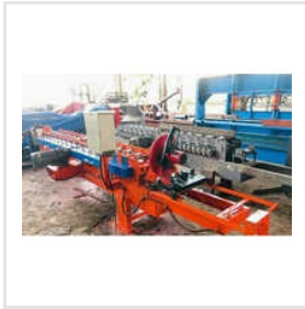
Rolling Shutter Machine