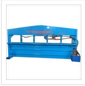
Industrial Sheet Cutting Sharing