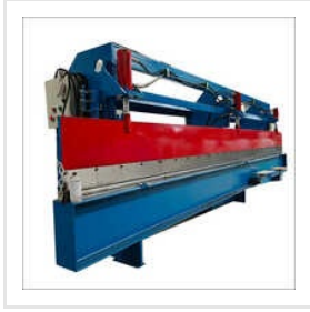
Industrial Roof Accessories Bending