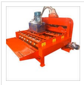
Hydraulic Crimping Machine