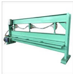
DOUBLE DECK ROOF ROLL FORMING MACHINE