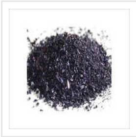
Flakes Potassium Permanganate Flake