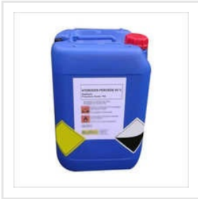
Hydrogen Peroxide 85 %