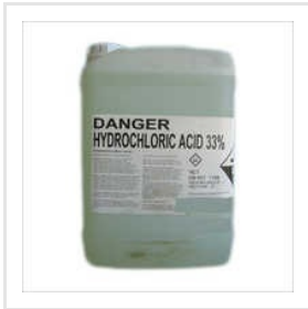
Liquid Hydrochloric Acid