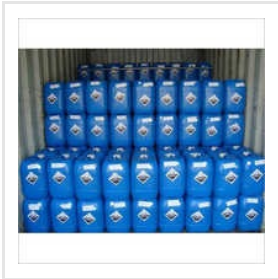
Liquid Phosphoric Acid