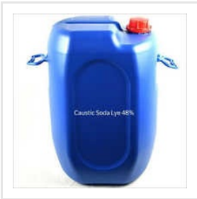
Chemical Liquid Soap Container