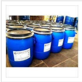
Anhydrous Aluminum Chloride