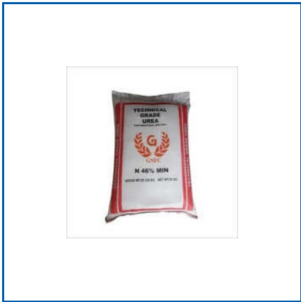
50KG TECHNICAL GRADE UREA

25kg Stable Bleaching Powder, 35kg Phosphorus Trichloride, 50kg Technical Grade Urea, Acetic Acid, Anhydrous Aluminum Chloride, Benzyl Alcohol, Benzyl Chloride, Calcium Chloride, Caustic Potash Flake, Caustic Potash Lye, Caustic Soda Flakes, Caustic Soda Lye, Caustic Soda Prill, Chemical Liquid Soap Container, Citric Acid, etc.