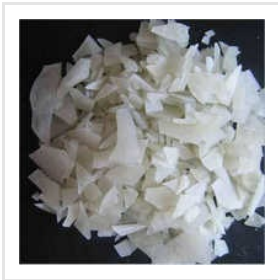
Caustic Potash Flake