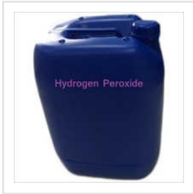
Liquid Hydrogen Peroxide