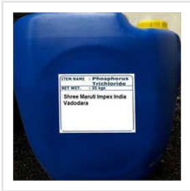
35kg Phosphorus Trichloride