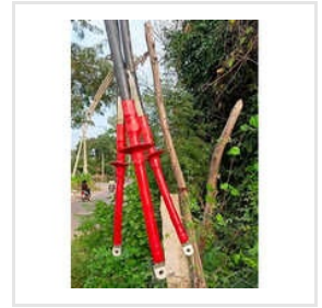
22kv ABC Cable Jointing Kits