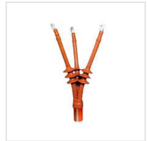
Electrical Cable Joints