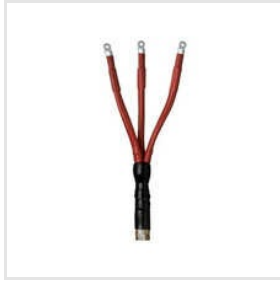
12 Kv Electrical Cable Joints