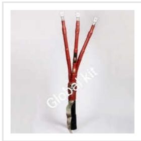
Heat Shrinkable Joints Global Kit