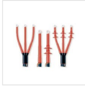
Low Voltage Raychem Cable Jointing Kits