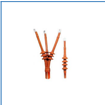
3 CORE RAYCHEM CABLE JOINTING KITS

11 Kv Indoor Termination Kit, 11Kv Outdoor Termination Kit, 11kV Raychem Cable Jointing Kits, 12 Kv Electrical Cable Joints, 13 Kv Heat Shrinkable Joints, 22kv ABC Cable Jointing Kits, 3 Core Electrical Cable Joints, 3 Core Outdoor Termination Kit, 3 Core Raychem Cable Jointing Kits, 300mm 12 Kv Outdoor Termination Kit, 33 Kv Heat Shrinkable Joints, 3m Heat Shrinkable Joints, 40mm Overhead Line Insulation Sleeves, Electrical Cable Joints, H2S Cable Joint, etc.