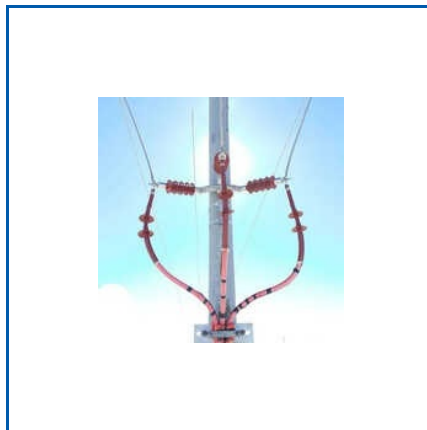
HIGH VOLTAGE CABLE JOINTING KIT