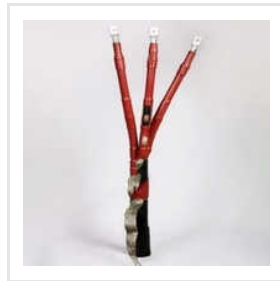
3m Heat Shrinkable Joints