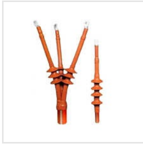
33 Kv Heat Shrinkable Joints