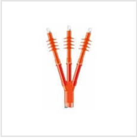
3 Core Outdoor Termination Kit