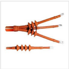
13 Kv Heat Shrinkable Joints