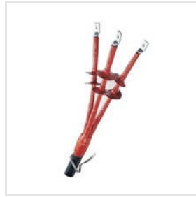
Red Electrical Cable Joints