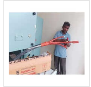
11 Kv Indoor Termination Kit