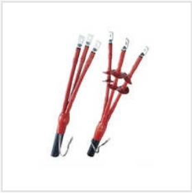
11Kv Outdoor Termination Kit