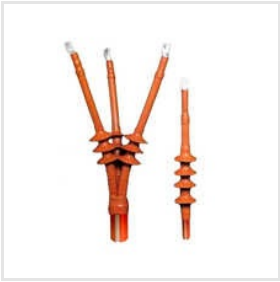
Red Outdoor Termination Kit