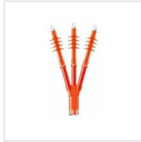
11kv Raychem Cable Jointing Kits