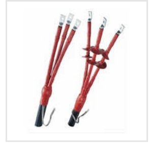
300mm 12 Kv Outdoor Termination Kit