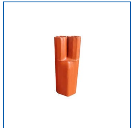
H2S CABLE JOINT