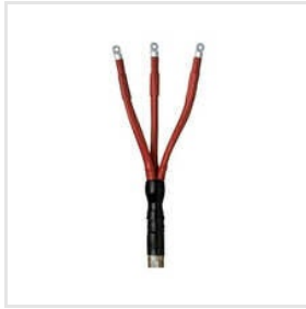
3 Core Electrical Cable Joints