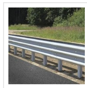
Metal Beam Crash Barrier