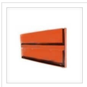
Slab Form Shuttering