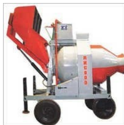
REVERSIBLE CONCRETE MIXER