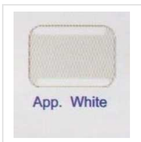
White Roofing Sheet