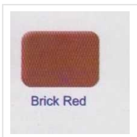
Brick Red Roofing Sheet