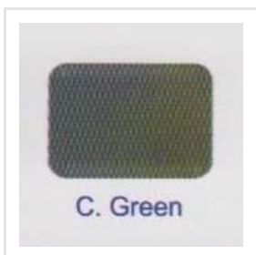
Sea Green Roofing Sheet