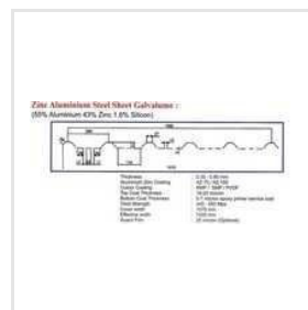
PPGL Roofing Sheets