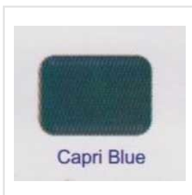
Capri Blue Roofing Sheet