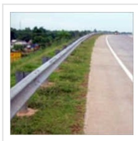
Highway Metal Crash Barrier