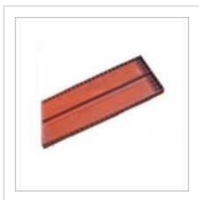
Wall Form Shuttering Plate