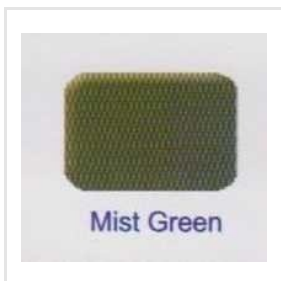
Mist Green Roofing Sheet