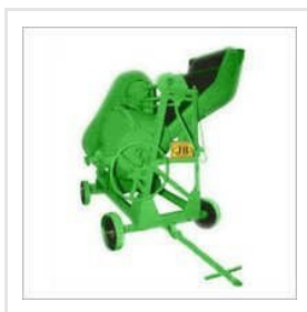
Concrete Mixer Machine