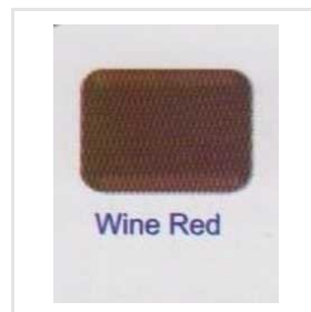
Red Roofing Sheet