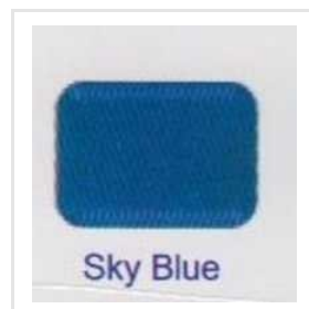
Sky Blue Roofing Sheet