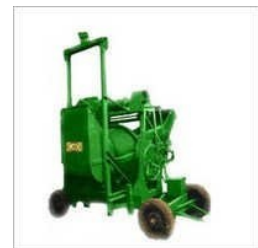
CONCRETE MIXER CUM HOIST