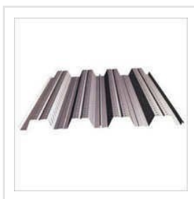
Deck Profile Roofing Sheets