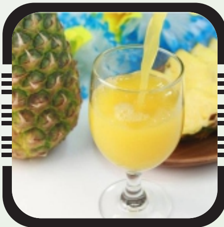
Pineapple Instant Drink Mix