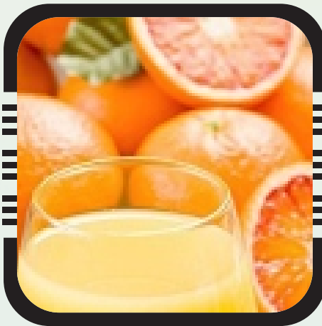
Orange Instant Drink Mix