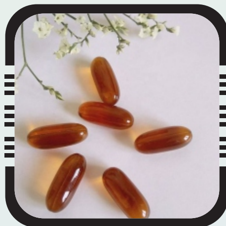
Lycopene With Vitamins And Minerals Capsules