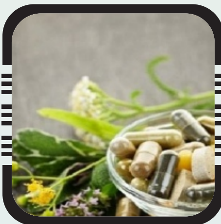
Food Supplements Capsules