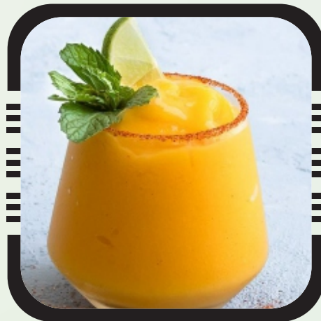
Mango Instant Drink Mix