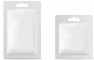
Coral Calcium Sachet