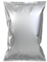
Vitamin D3 Sachets