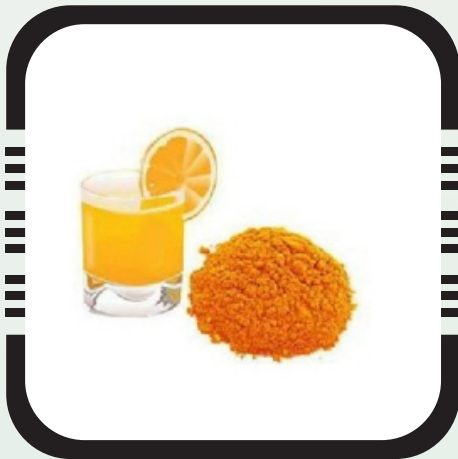
Instant Drink Mix Orange