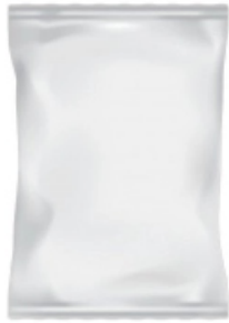
Amino Acid Sachets