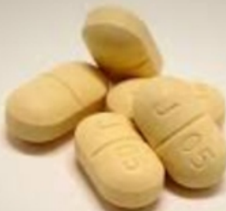
Collagen Peptides Tablets