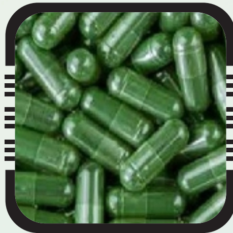
Spirulina With Multivitamins Capsules