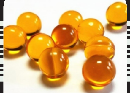
Vitamin E Soft Capsules