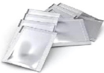
L Arginine Sachets