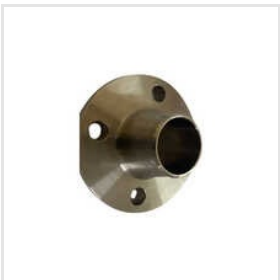
MS WNRF Neck Flange