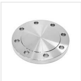
3 Inch Mild Steel Blind Flanges