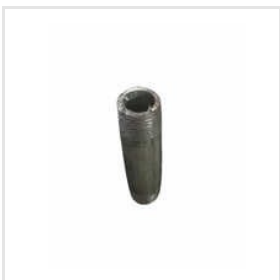
Ms Pipe Nipple