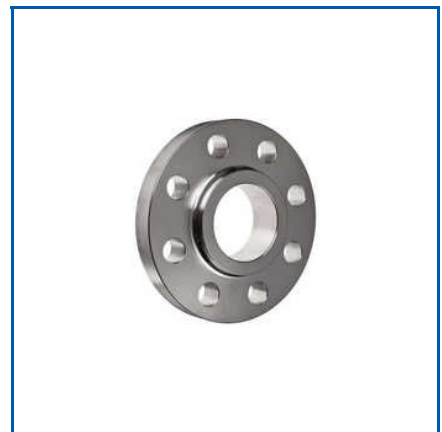
MILD STEEL FLANGES