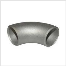
Mild Steel Short Bend