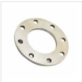
4 Inch Mild Steel Flanges