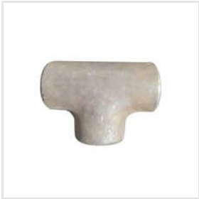
Ms Tee Elbow