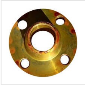
Weld Neck Flanges