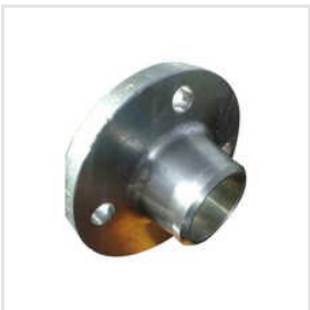
Class 150 WNRF Flange