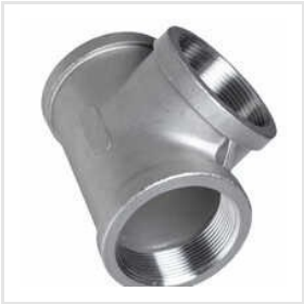
Mild Steel Tee