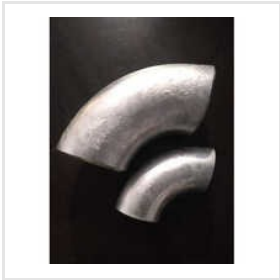
GI Short Bend