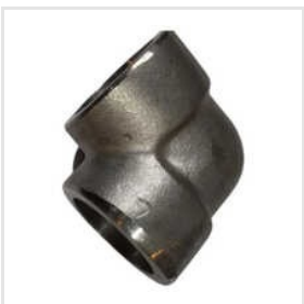
Threaded Mild Steel Elbows