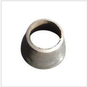
High Grade MS Reducer