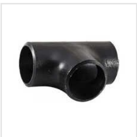
Mild Steel Tee