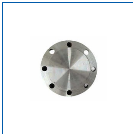
MS BLIND FLANGES