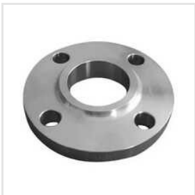
5 Inch Mild Steel Flanges