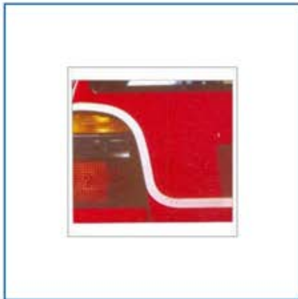
FINELINE MASKING TAPE