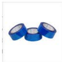
SVPL Seam Sealing Tape