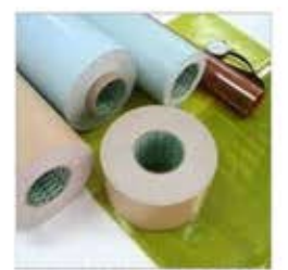
Flexo Printing Tapes