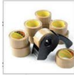
Rubber Adhesive BOPP Tapes