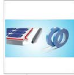
Acrylic Foam Tapes