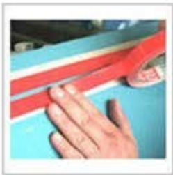
Crepe Paper Masking Tapes