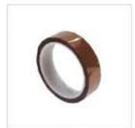
Pre Glued Tapes