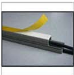
Double Sided Adhesive Tapes