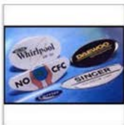
Double Sided Polyester Tapes