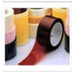
Heat Activated Tapes