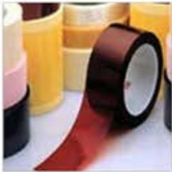
Heat Activated Bonding Tapes