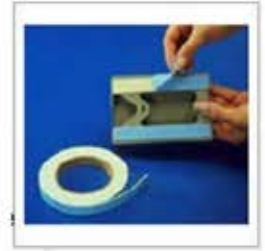
Double Sided Foam Tapes