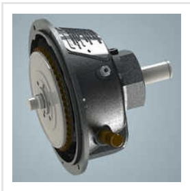
Mechanical Power Take Off