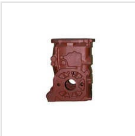
Gray Iron Casting