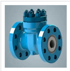
Swing Check Valve