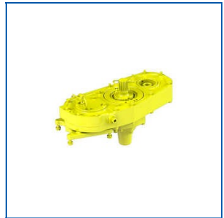
ENGINE POWER TAKE OFFS