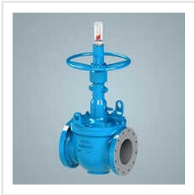
T Ball Valve