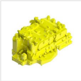
Transmission Control Valves