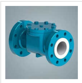
Swing Check Valve