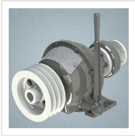
Power Take Offs