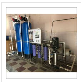
1000 LPH RO Plant