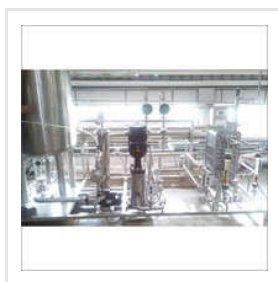
SS RO Plants For Pharma