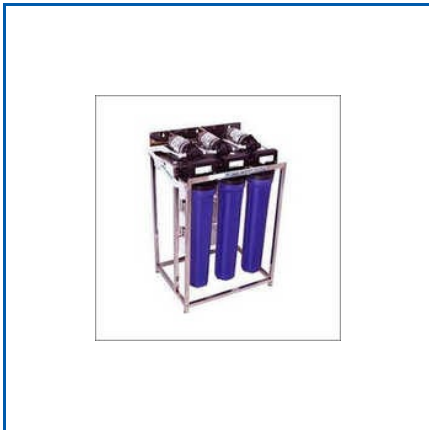
DOMESTIC RO FOR OFFICES

1000 LPH RO Plant, Advance Sewage Treatment Plant, Biocelerator 500, Coin Water Vending Machine, Containerized ETP Plant, Domestic RO For Offices, Environmental Safety Consultancy Services, Hemodialysis RO Plant, Mobilised Water Treatment Plants, RO Membrane, RO Membrane Cleaning, RO Plant with EDI, SS RO Plants For Pharma, STP Plant, Waste Plants Green Field Projects, etc.