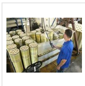
RO Membrane Cleaning