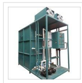
Containerized ETP Plant