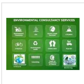
Environmental Safety Consultancy Services