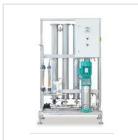
Hemodialysis RO Plant