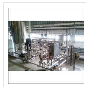
RO Plant With EDI