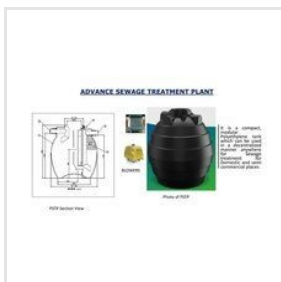
Advance Sewage Treatment Plant