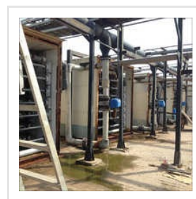
Mobilised Water Treatment Plants