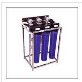
Domestic RO For Offices