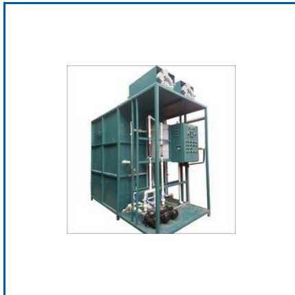
CONTAINERIZED ETP PLANT