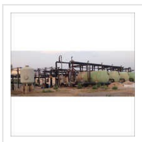
Water Filtration Plants