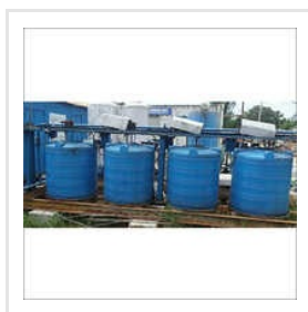
Waste Plants Green Field Projects