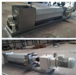
DEWATERING SCREW PRESS

Dewatering Screw Press, Double Rotational Type Fine Grinder Machine, Bio Gas Dewatering Screw Press, Coarse Grinding Machines, Dewatering Screw Press, Double Rotating Type Fine Grinder, Double Rotational Fine Grinder For Corn Industries, Fiber Dewatering Screw Press, Germ Dewatering Screw Press, Pin Mill For Maize Starch Plant, Solid Liquid Separator Machine, etc.