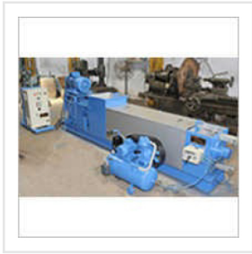
Dewatering Screw Press