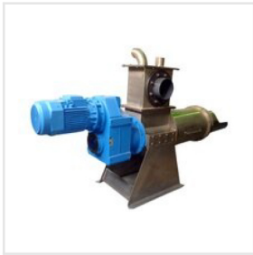
Solid Liquid Separator Machine