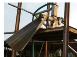
BIO GAS DEWATERING SCREW PRESS