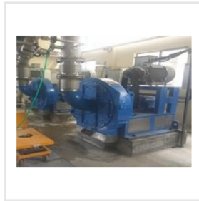
Coarse Grinding Machines