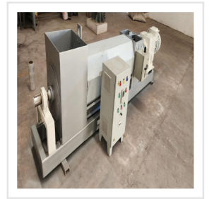
Fiber Dewatering Screw Press