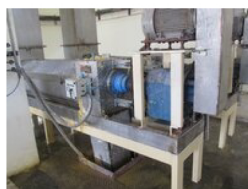
GERM DEWATERING SCREW PRESS