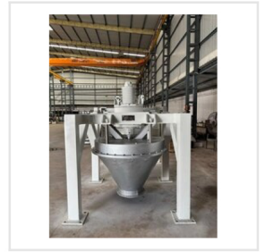
Pin Mill For Maize Starch Plant