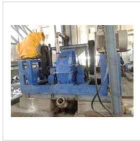
Double Rotating Type Fine Grinder