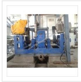
Double Rotational Fine Grinder For Corn