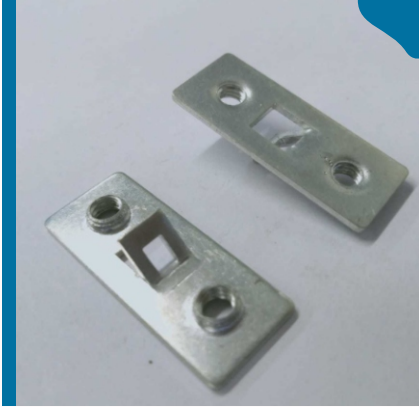
Automotive Sheet Metal Components