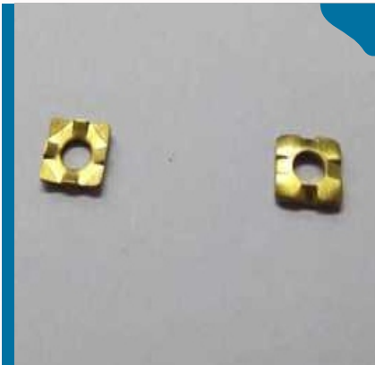
Pressed Metal Parts