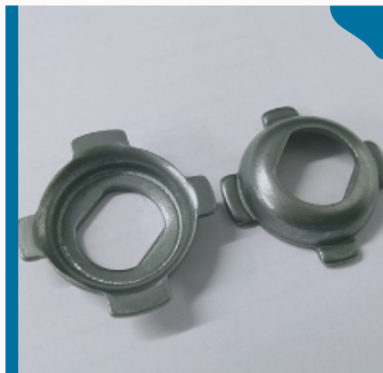
Pressed Component Ms