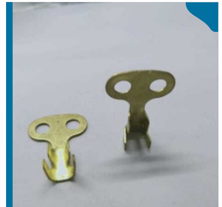
Power Press Components