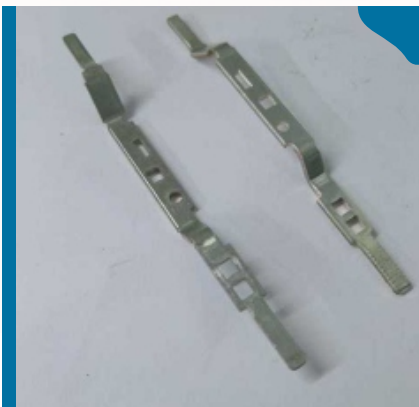
Precision Sheet Metal Component