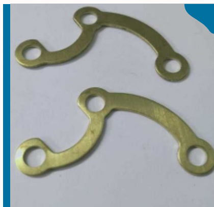
Automotive Stamping Parts