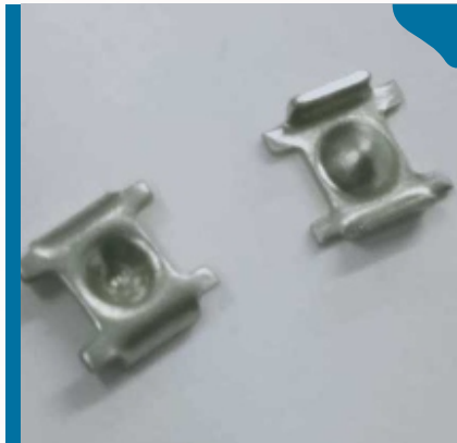
Sheet Metal Press Parts