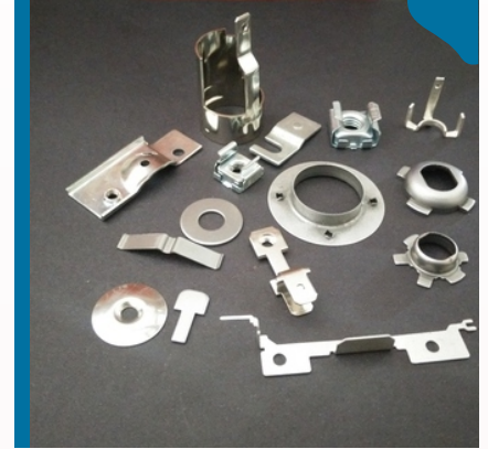
Sheet Metal Pressed Components