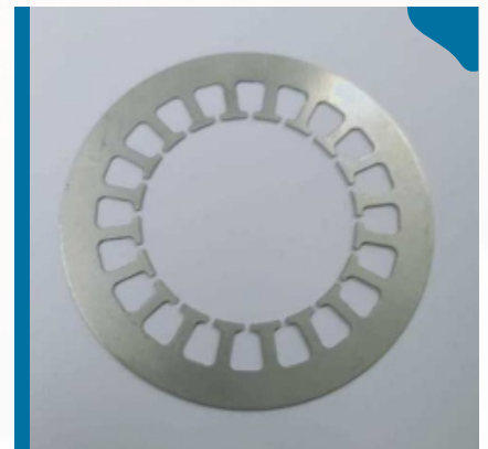
Automobile Sheet Metal Parts