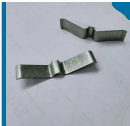
Custom Sheet Metal Parts