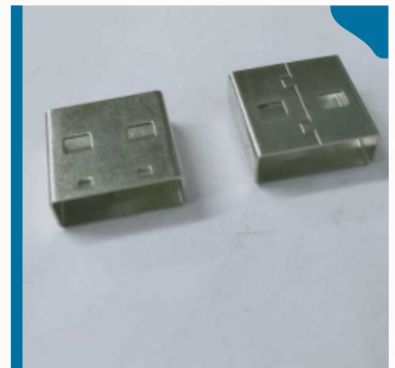
Precision Metal Stamping Parts