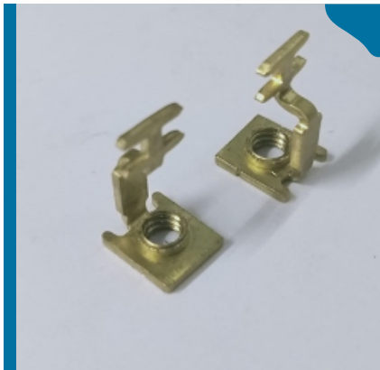
Brass Pressed Component