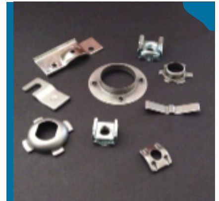
Press Tool Components