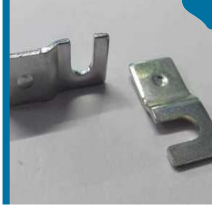
Fly Press Parts