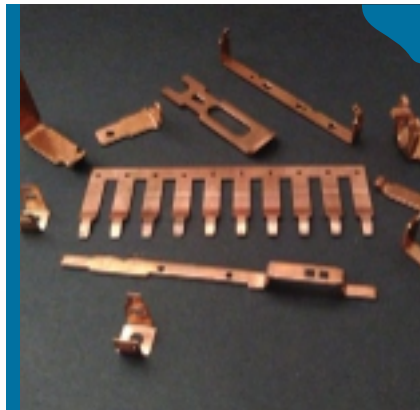
Progressive Sheet Metal Component