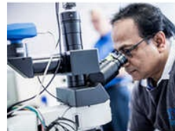
Metallography Testing Services