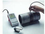
Ferrite Testing Services