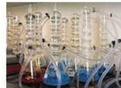
Corrosion Testing Services