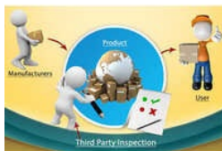
THIRD PARTY QUALITY INSPECTION SERVICES

Bend Testing Services, Borescope Inspection Testing Services, Chemical Analysis Spectrometry Testing Services, Corrosion Testing Services, Digital Hardness Testing Services, Dye Penetrant Testing Services, Eddy Current Testing Services, Ferrite Testing Services, Hardness Testing Services, Helium Leak Testing Services, Industrial Welding Consultancy Services, Infrared Inspection Services, Metallography Testing Services, Oxide Layer Measurement Services, Pmi Testing Services, etc.