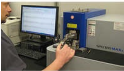
Chemical Analysis Spectrometry Testing