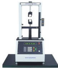
Tensile Testing Services