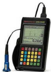
Oxide Layer Measurement Services