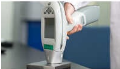
Pmi Testing Services