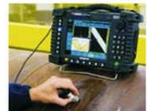
Ultrasonic Testing Services