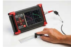
Eddy Current Testing Services