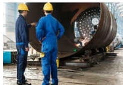
INDUSTRIAL WELDING CONSULTANCY SERVICES