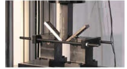
Bend Testing Services