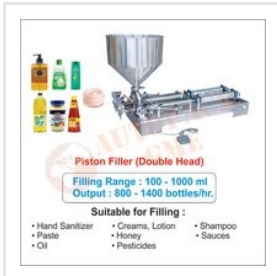
Gel Filling Machine (Double Head)