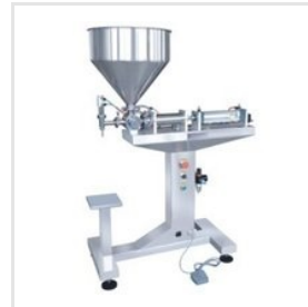
Semi Automatic Sauce Filling Machine