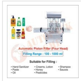
Automatic Hand Sanitizer Filling