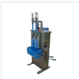
Corrosive Disinfection Liquid Filler Bleach