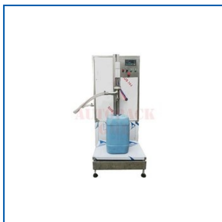
SEMI AUTOMATIC LIQUID FILLER WITH WEIGHING SYSTEM

12 Head Lubricants Oil Filling Machine, 2 in 1 Shrink Packing Machine, 4 Head Pneumatic Sauce Filling Machine, 4 Head Pneumatic Shampoo Filling Machine, 4 Line Automatic Cup Glass Filling Sealing Machine, 8 Head Oil Filling Machine, Automatic 12 Head Oil Filling Machine/Automatic Cream Gel Liquid Paste Lotion Filling Machine, etc.