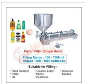
Hand Sanitizer Filling Machine/ Disinfection