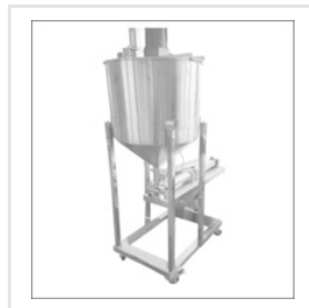
Tomato Sauce Filling Pneumatic Machine