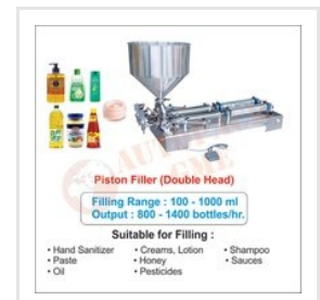
Semi Automatic Honey Filling Machine