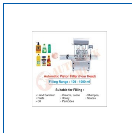
AUTOMATIC SAUCE FILLING MACHINE AUTOMATIC PISTON FILLER