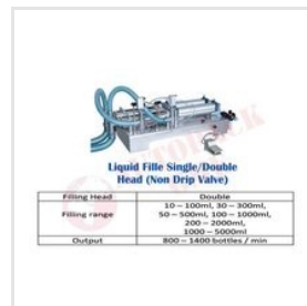
Sharbat / Squash Volumetric Liquid