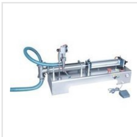
Pesticide Filling Machine