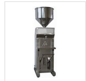
Pedal Operated Cream And Paste Filling