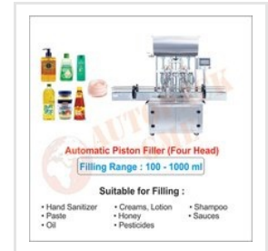
Automatic Liquid Filling Machine