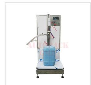
Semi Automatic Weighing Liquid Filler