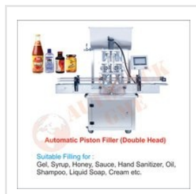
Automatic Oil Filling Machine (Double)