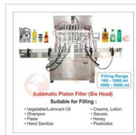
Disinfection Liquid Gel Filling Machine 6 Head