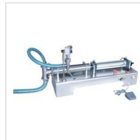
Liquid Syrup Filling Machine