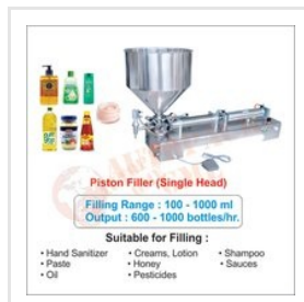
Sanitizer Filling Machine/Liquid,