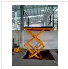
Scissor Goods Lift