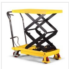
Manual Scissor Lift