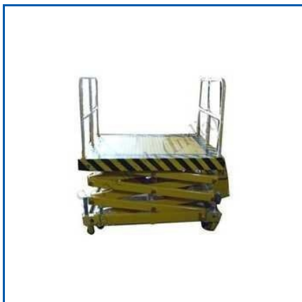
MOVABLE SCISSOR LIFT

11mtr. Movable Lift, Aerial Mast Platform, Automotive Lifts, Car Lift Scissor Type, Car Lift Traction, Car Parking Lift, Dock Leveler, Dock leveler with scissor lift, Double Mast Ariel Platform, Double Scissor Lift, Double mast aerial work platform, Electric Stacker, Fixed Type Goods Lifts, Goods Lifting Scissor Lift, Goods Lifts, etc.