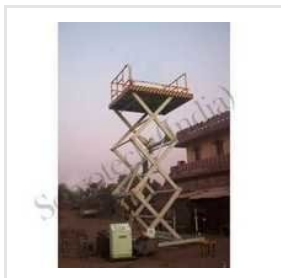
Triple Scissor Lift