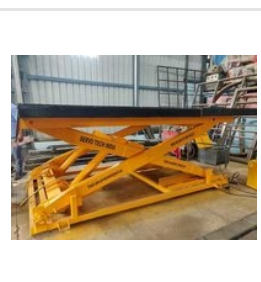
Single Scissor Lift