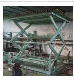
Double Scissor Lift