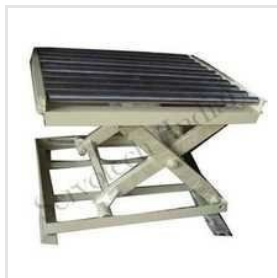
Roller Scissor Lifts