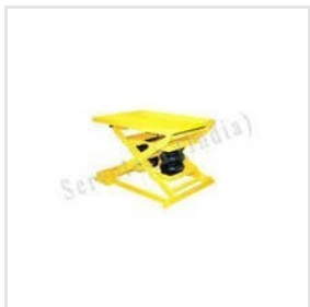
Pneumatic Scissor Lifts