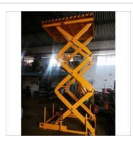
High Rise Scissor Lift