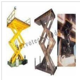
Heavy Duty Goods Lift