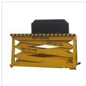
Heavy Duty Scissor Lift