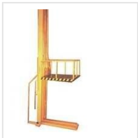
Hydraulic Goods Lifts