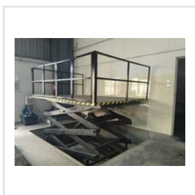
Power Scissor Lift