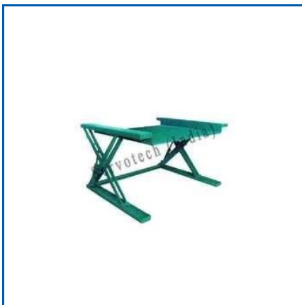
ZERO LEVEL LIFT