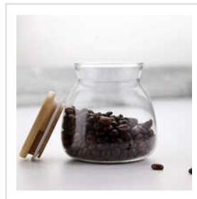
Chocolate Storage Glass Jar