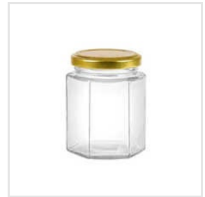
Transparent Glass Jar