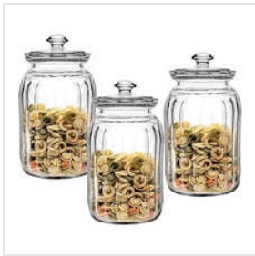
Transparent Glass Food Jar