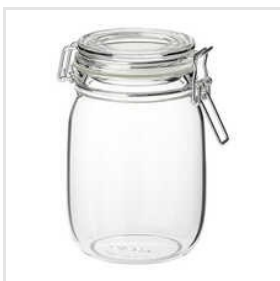
Glass Storage Jar For Home Uses