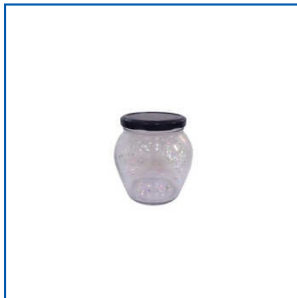
GLASS MATKI JAR