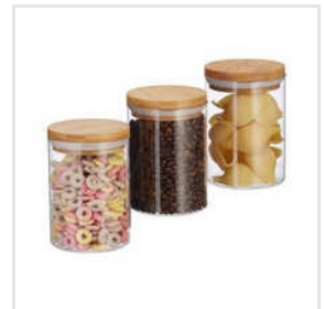
Glass Snaks Jar