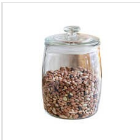
Transparent Glass Jar