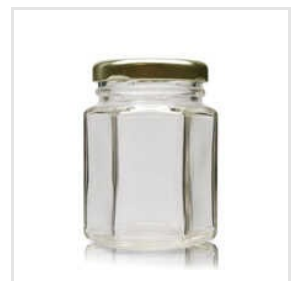
Honey Glass Jar