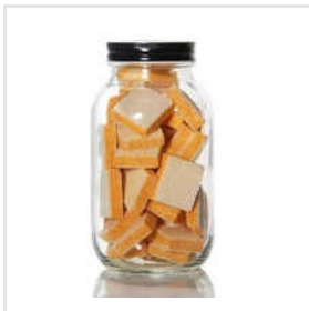
Rusk Storage Glass Jar