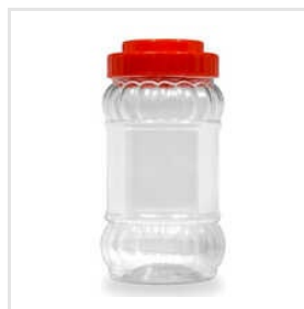
Glass Murabba Jar