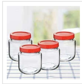
Glass Pickle Jar