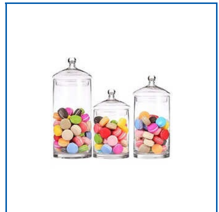
GLASS TOFFEE JAR