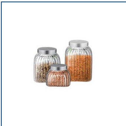
GLASS FOOD JAR

12 Inch Round Table Glass Lamp, Attar Bottle, Attar Oil Bottle, Beverage Glass Bottle, Blue Glass Perfume Bottle, Ceiling Glass Lamp, Chocolate Storage Glass Jar, Colored Empty Glass For Decoration, Colored Round Glass Stones, Colorful Candle Glass Votive, Colorful Glass Bottle, Colorful Water Glass, Colorfull Glass, Cosmetic Glass Bottle, Crack Resistance Glass Perfume Bottle, etc.