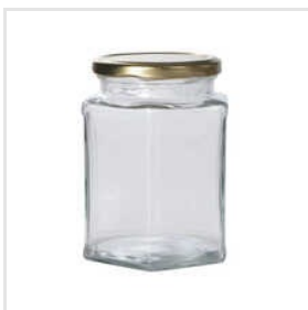
Kitchen Glass Jar