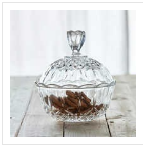
Glass Candy Jar