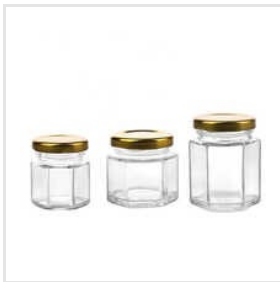
Glass Hexagonal Jar