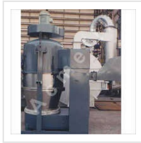
Batch Type Fluid Bed Dryer