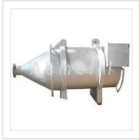
Direct Fired Hot Air Generator