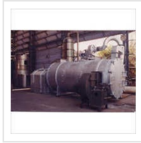
Indirect Fired Hot Air Generator