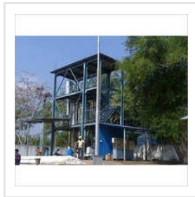
Standard Industrial Evaporators