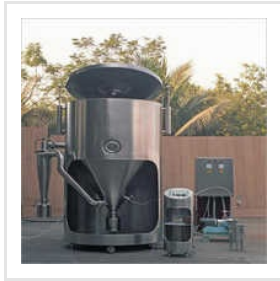
Lab Scale Pilot Spray Dryer