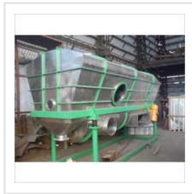
Vibratory Fluid Bed Dryer