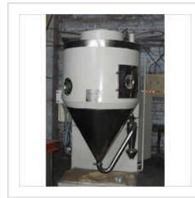
Closed Loop Spray Dryer