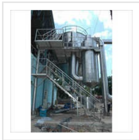
Rotary Atomizer Type Spray Dryer