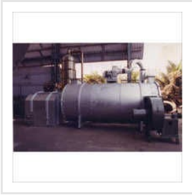
Industrial Hot Air Generator