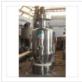
Stainless Steel Fluid Bed Dryer