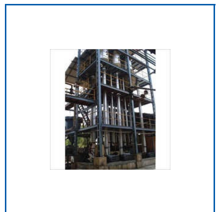
FORCED CIRCULATION EVAPORATOR