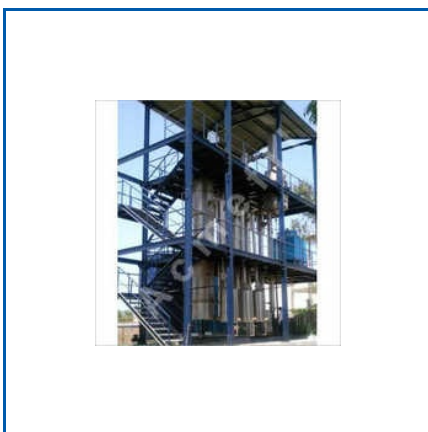
FALLING FILM EVAPORATOR

Automatic Flash Dryer, Batch Type Fluid Bed Dryer, Centrifugal Atomizer, Closed Loop Spray Dryer, Direct Fired Hot Air Generator, Effluent Evaporator, Effluent Spray Dryer, Falling Film Evaporator, Fluid Bed Granulator Cum Coater, Fluid Bed Processor, Fluidized Bed Dryer, Forced Circulation Evaporator, Hybrid Evaporator, Indirect Fired Hot Air Generator, Industrial Air Lock Valve, etc.