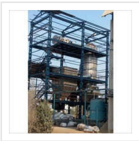
Nozzle Type Spray Dryer