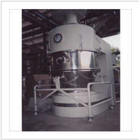
Fluidized Bed Dryer