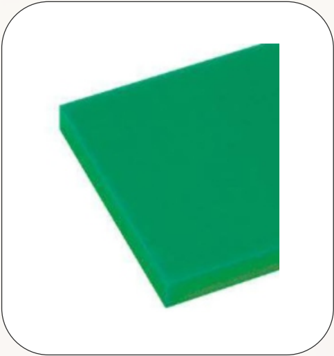
UHMWPE Wear Plate