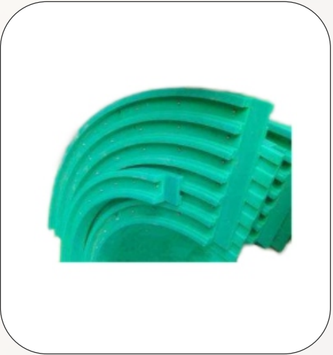
UHMWPE Corner Track