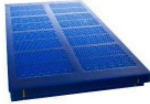
Polyurethane Mining Screen