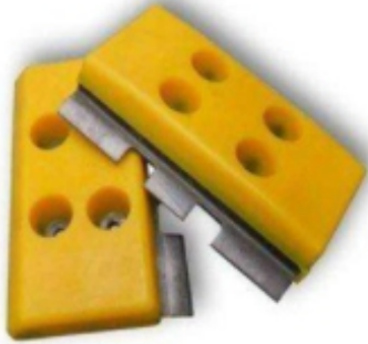
PU Paver Track Pad