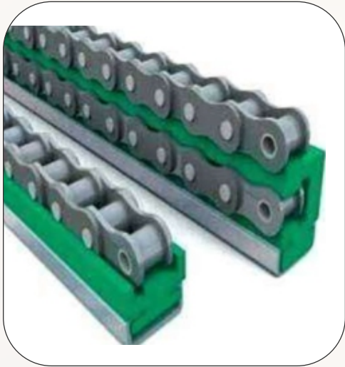
UHMWPE Chain Guide