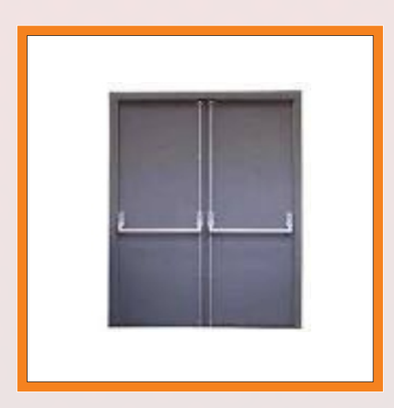
Fire Shielding Door