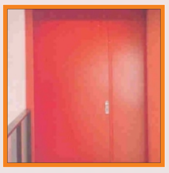
Fire Resistant Stainless Steel Door