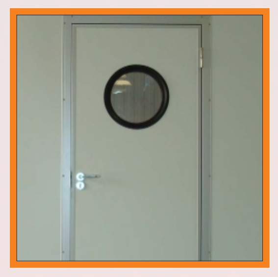
Air Tight Resistance Door