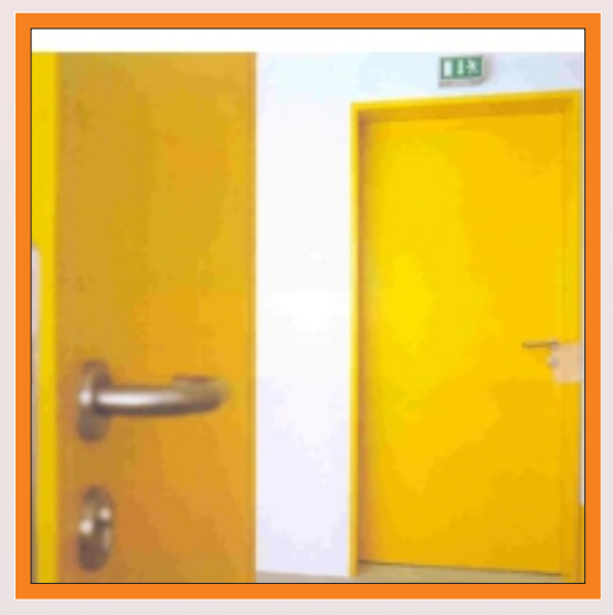
Fire Resistant Steel Doors