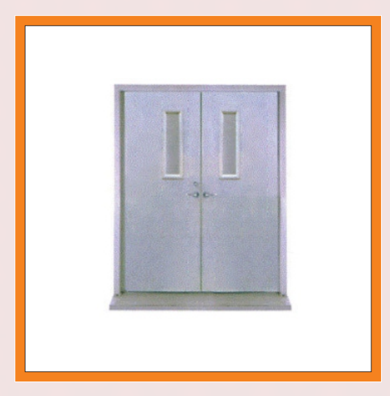
Fire Resistant Doors