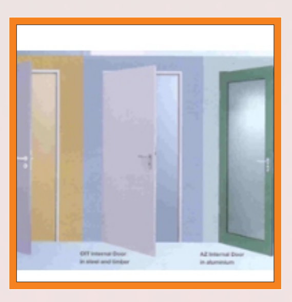
Steel Soundproof Door