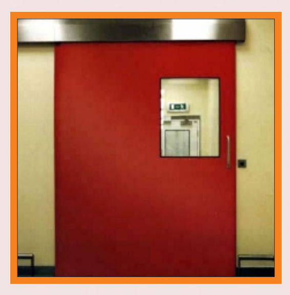
Sliding Fire Doors