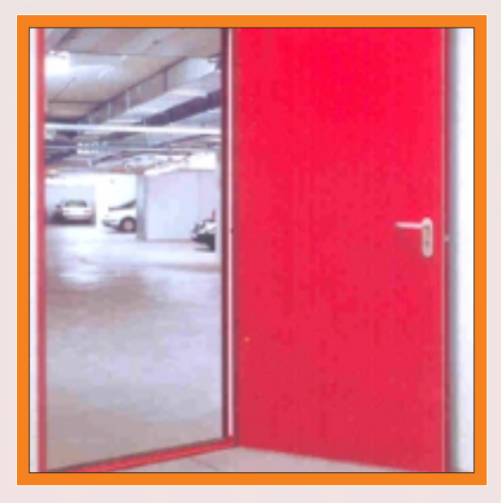
Emergency Exit Door