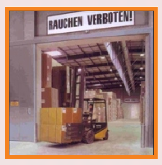
Fire Protected Combined Doors