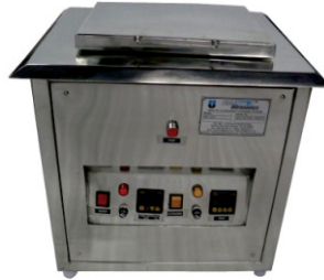
(Tabletop Ultrasonic cleaner)