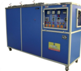
(Multistage vapour Degreasers)