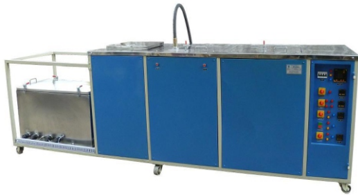
4 Chamber (Pre-Clean, Jet wash, Ultrasonic, Air Dryer) Storage Tank Out Side