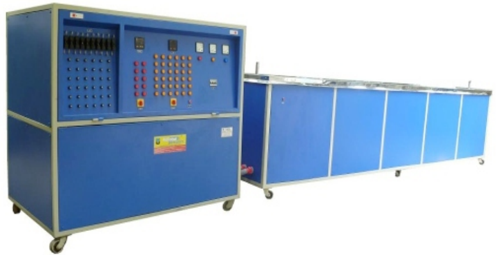
Large Capacity Ultrasonic Cleaner (Custom Designed)