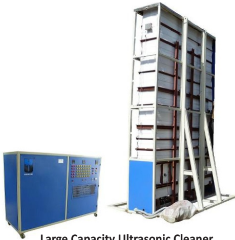
Large Capacity Ultrasonic Cleaner (Custom Designed)