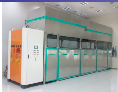
Multistage Material Handling (automatic Conveyor) Cleaning Systems Side View