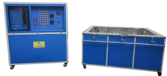
Large Capacity Ultrasonic Cleaner (Custom Designed)