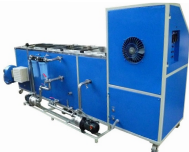
4 Chamber (Jet wash, Ultrasonic, Air Wash, Hot Air Dryer) Storage Tank inside & Back Side View with filtration Unit