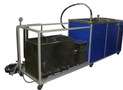
2 Chamber (Jet Was & Ultrasonic) Storage Tank Out Side