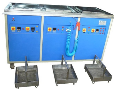
3 Chamber (Ultrasonic, Rinsing, Hot Air Dryer)