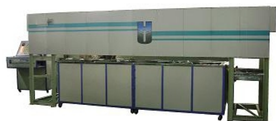
Multistage Material Handling (automatic Conveyor) Cleaning Systems Side View