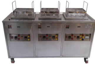
3 Chamber (Ultrasonic, Rinsing, Hot Air Dryer)