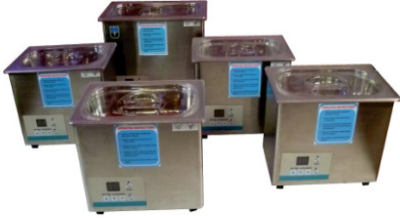
(Compact Ultrasonic cleaner)