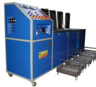
4 Chamber (Jet wash, Ultrasonic, Air Wash, Hot Air Dryer) Storage Tank inside & Front Side View with filtratin Unit