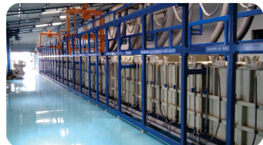
Multistage Material Handling (automatic Conveyor) Cleaning Systems Side View