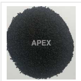
Tukmaria Seeds, Sweet Basil Seeds, Sabja