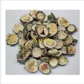
Dried Bitter Melon Sliced