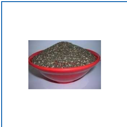
SALVIA HISPANICA / CHIA SEED

APEX Chamomile tea, Acacia Concinna, Acacia Arbica Gum, Accorus Calamus, Aceroala Juice Powder, Acorus Calamus, Acorus Calamus Powder, Acorus Calamus Roots Whole, Acorus Calamus Small, Acorus Calamus T Cut, Aegle Marmelos, Ajmod, Ajwain Seeds, Aloe Vera Leaf Juice Powder, Aloweed, etc.