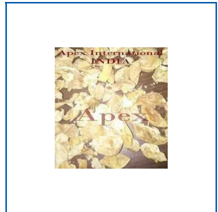
CITRUS LEMON PEEL