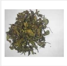
Java Tea Whole