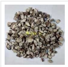
Acorus Calamus Small