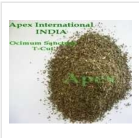
Holy Basil T Cut