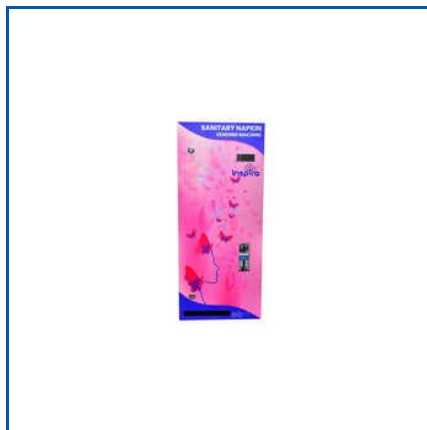
PRONEXT AUTOMATIC UPI BASE SANITARY NAPKIN VENDING MACHINE