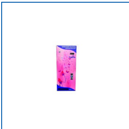
FACE MASK VENDING MACHINE

01 Basic 25 Sanitary Napkin Vending Machine, 01_10W Solar LED Street Light, 01_12 Watt Solar Led Street Light, 01_Solar LED Street Light, 01_Solar Led Street Light, 02_10W Solar LED Street Light, 02_Solar LED Street Light, 02_Solar Led Street Light, 100 Capacity Cloth Bag Vending Machine, 100 Napkins Capacity Vending Machine, etc.