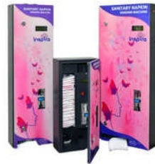
Pronext Free Vending Sanitary Napkins