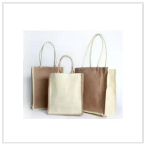
Eco Friendly Reusable Jute Carry Bag