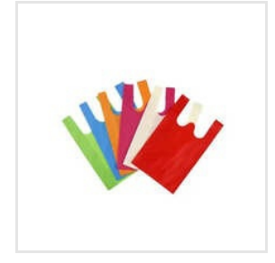
Custom Made Non Woven W Cut Carry