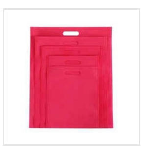
Gms Enterprises D Cut Non Woven Carry Bags