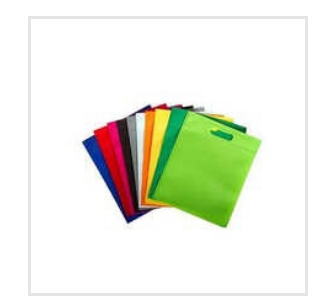
Biodegradable Non Woven D Cut Carry Bag