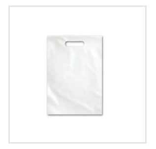
Non Woven D Cut Carry Bag 12x16x12 for Food Packaging