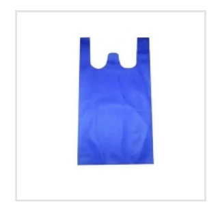
Printing Textile Packaging Non woven W Cut Carry Bag