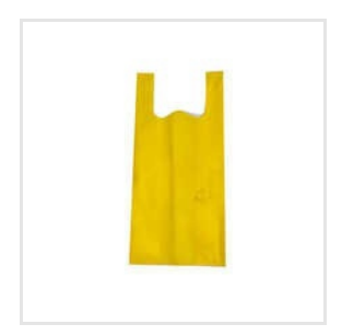
Non Woven W Cut Carry Bag