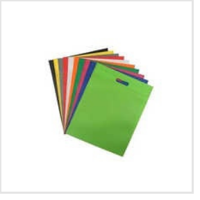
Eco Friendly Customized