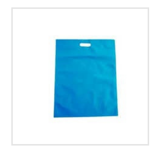
High Efficiency Packaging And