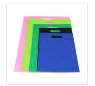
D Cut Non Woven Bag Design