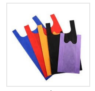
Custom Printed Non Woven W Cut Carry