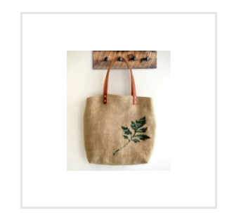
Standard Quality Jute Tote Bag for Embroidery DIY Art Craft