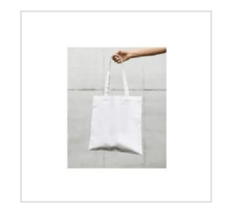
Easy to Carry Highly Demanded Reusable Jute Carry Bag