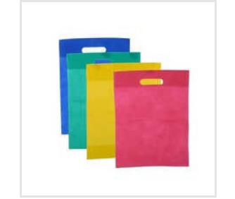
Non Woven D Cut Carry Bag 16x20