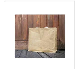
Highly Demanded Best Selling Reusable Jute Carry Bag