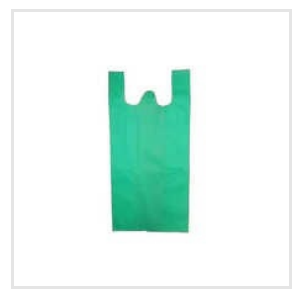
Biodegradable Non Woven W Cut Carry