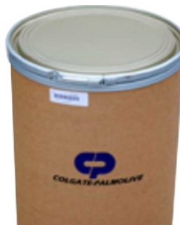
Printed Paper Drum