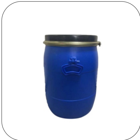
45 liters Open Top Drums