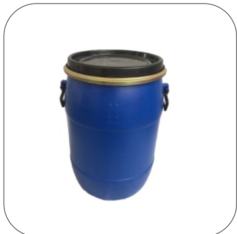
HDPE Plastic 50 And 55 Liters Open Top Drums