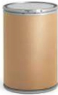
Plain Paper Drum