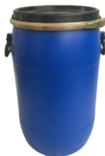
65 Liter Plastic Open Top Drums