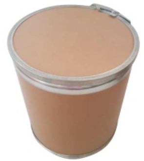
Plywood Lid Fibre Drum