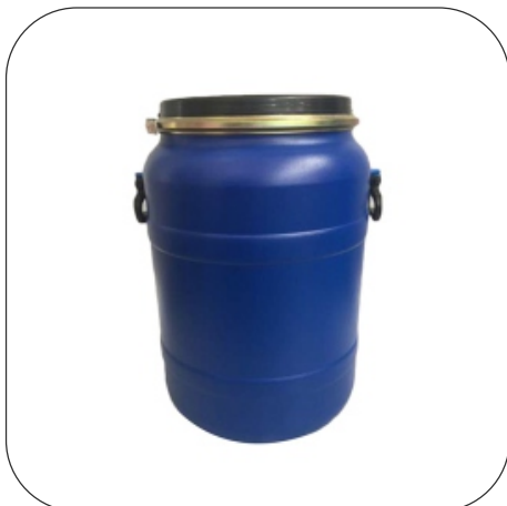
HDPE 65 Liter Plastic Open Top Drums