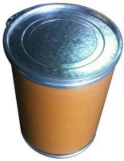
GI Metallic Lid Fibre Drum