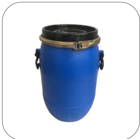
30 liter HDPE Plastic Open Top Drums