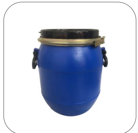
HDPE Blue 20 or 25 L Plastic Open Top Drums