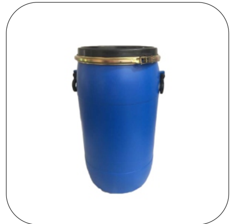
70-75 Ltr Open Top Drums