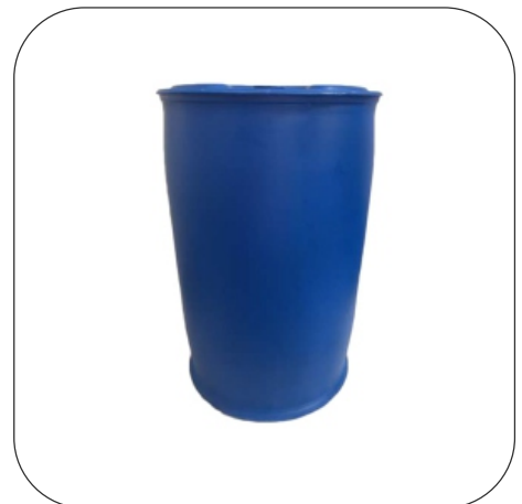
210 Liter - Ring Plastic Drum