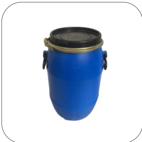
35-37 Ltr Open Top Drums