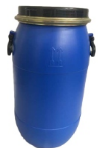
HDPE 60 Liter Plastic Open Top Drums