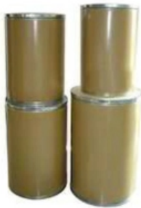
Varnished Paper Drum