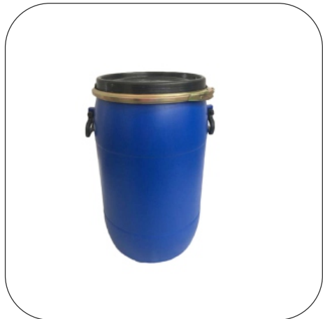
80-85 Ltr Plastic HDPE Open Top Drums