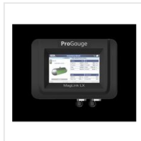
ProGauge Console (LX Console)