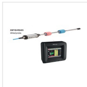
ProGauge Automatic Tank Gauging System