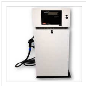
Tokheim Quantum Q130 Adblue (DEF)