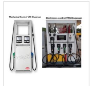
Tokheim Quantum Vapour Recovery