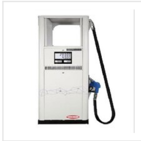
Q130 C Mobile Dispenser Single Nozzle