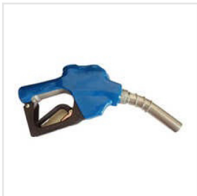
OPW NOZZLE 7HB-11AP