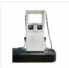
Q330 Dual HD HD Pressure Type