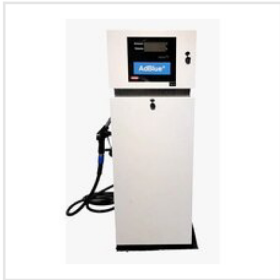
Mono Dispenser Single Nozzle Presser Type