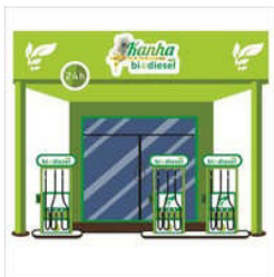
INDUSTRIAL BIODIESEL PUMP DEVELOPMENT SERVICES

Double Nozzle Fuel Dispenser, Dual Fuel Dispenser, Digital Fuel Dispenser, Suction Type Mobile Fuel Dispenser, and Quantum-Q130 Single Nozzle & Q 330 Double Nozzle Tokheim Dispenser, etc.