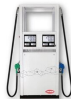
Q330 DUAL SD HD SUCTION TYPE