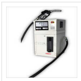
Tokheim Quantum Mobile Fuel Dispenser