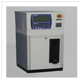
Q130 Mobile Dispenser Single Nozzle Heavy