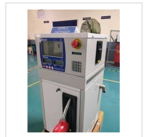
Mobile Fuel Dispenser