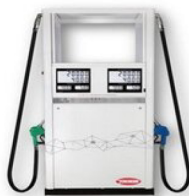
Q330 DUAL SD HD PRESSER TYPE