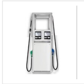
Q330 Multi-Purpose Pump With Standard