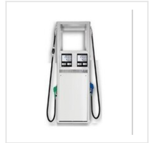
Q330 Multi-Purpose Dispenser With