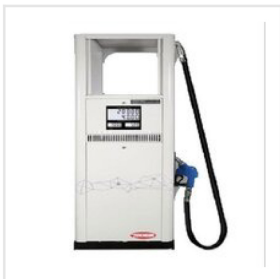
Q130 Mono Dispenser Single Nozzle Heavy