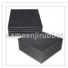
Elastomeric Bridge Bearing Pads