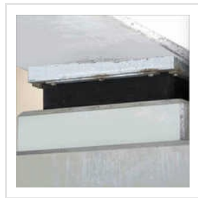
Neoprene Elastomeric Bridge Bearings