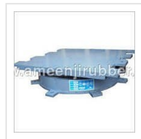
POT PTFE Bearings