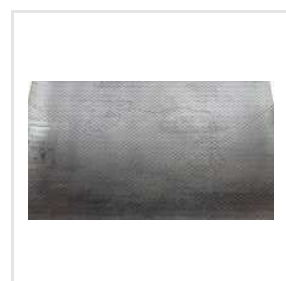
Rubber Cow Mats