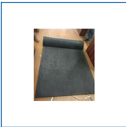
DAIRY COW MATS

Anti Vibration Pads, Basketball Floor Pads, Black Neoprene Rubber Pads, Blasting Rubber, Bridge Bearing Pads, Bridge Expansion Joints, Chicken Plucker, Chicken Plucker Rubber Finger Big Type, Chicken Plucker Rubber Finger Regular Type, Chicken Plucker Rubber Fingers (Dotted), Chicken Rubber Pluckers, Compression Expansion Joints, Compression Seal Expansion Joint, Compression Seal Expansion Joints, Cow Mat, etc.