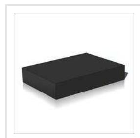
Elastomeric Bearing Pads