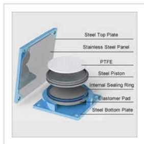
Pot Bearing Components