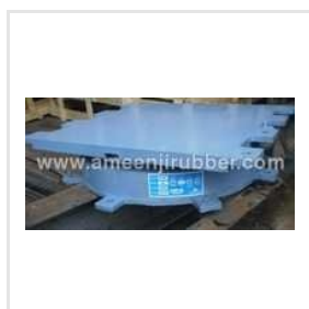
Fixed Pot Bearings