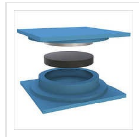
Pot PTFE Bearings For Bridges