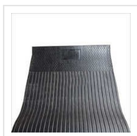
Dairy Cow Rubber Mat