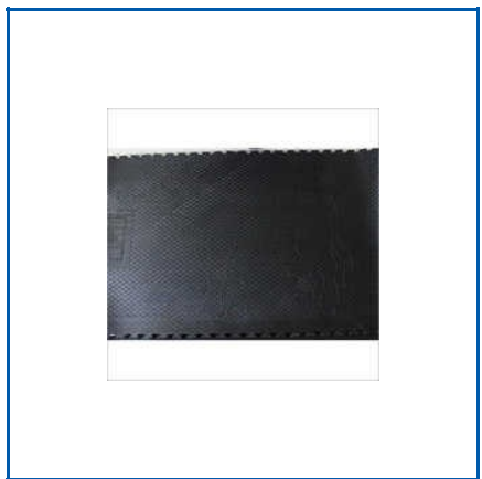
INTERLOCKING COW MAT