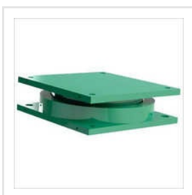
Pot Bridge Bearing