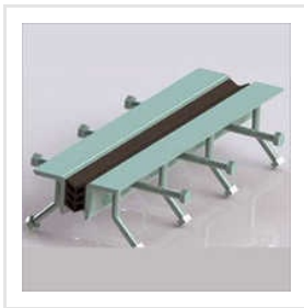
Compression Expansion Joints