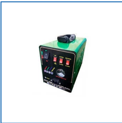
IRON SOLAR FENCING ZATKAN SYSTEM