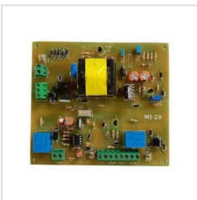
MI20 12V DC Card Reader