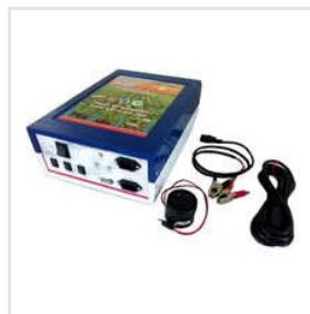
9.9 KV Metro Solar Fence Security System