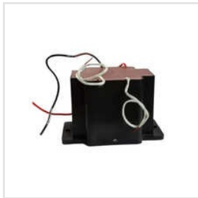
8 Kv 12V Zatkan Machine Transformer