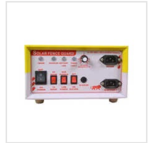
5 Kv Fiber Solar Zatka Machine