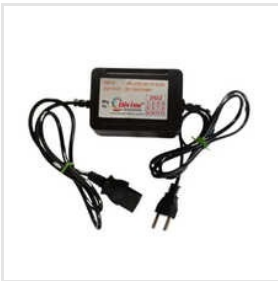
2 AMP 12 V Zatkan Machine Adapter