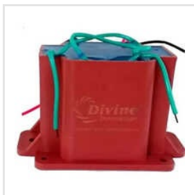
240V Single Phase Zatkan Machine