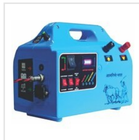
ABS Fiber Agriculture Solar Zatkan Machine