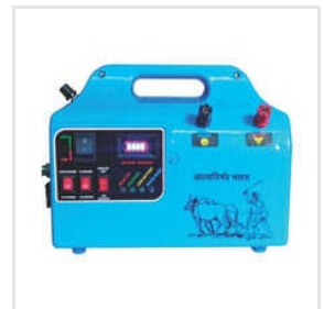
11 Inch Duple Power Solar Fence Energizer