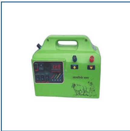
ABS PLASTIC SOLAR FENCING ZATKAN SYSTEM