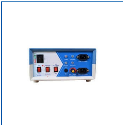
12V SOLAR FENCE ENERGIZER

11 Inch Duble Power Solar Fence Energizer, 12 V Solar Zatkan Machine, 12V Solar Fence Energizer, 2 AMP 12 V Zatkan Machine Adapter, 2.75 Inch ABS Plastic Insulators, 20MFD Capacitor For Solar Zatkan Machine Solar, 240V Single Phase Zatkan Machine Transformer, 3 Inch Fencing Corner Insulator, 5 kv Fiber Solar Zatkan Machine, 8 Kv 12V Zatkan Machine Transformer, 9.9 KV Metro Solar Fence Security System, 999 DC Single Phase Solar Zatkan Machine Transformer, ABS Fiber Agriculture Solar Zatkan Machine, ABS Plastic Solar Fencing Zatkan System, Fiber Double Power Solar Fence Energizer, etc.