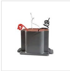
999 DC Single Phase Solar Zatka Machine