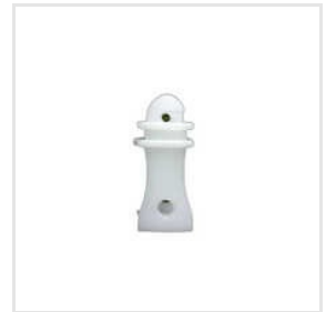
2.75 Inch ABS Plastic Insulators