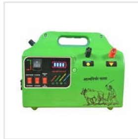
Fiber Double Power Solar Fence Energizer