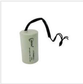
20MFD Capacitor For Solar Zatka Machine