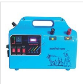
Metal Solar Zatkan Machine